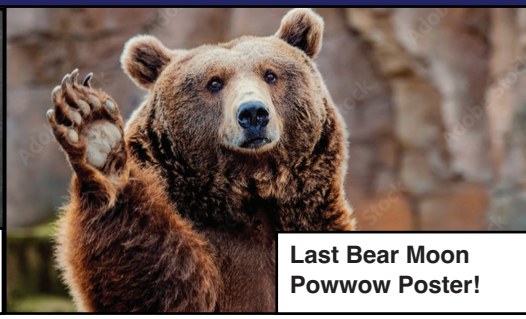
Last Bear Moon Powwow Poster!