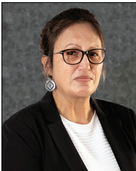
By Brian Chamberlain / Darla LaPointe Photo by

person to fill the position since it was created in 2015. One tribal council member from that period stated, "We created the position so the tribal organization could have a leadership role filled at all times. It's interesting to note that each of the tribal members who've held the post have been women."