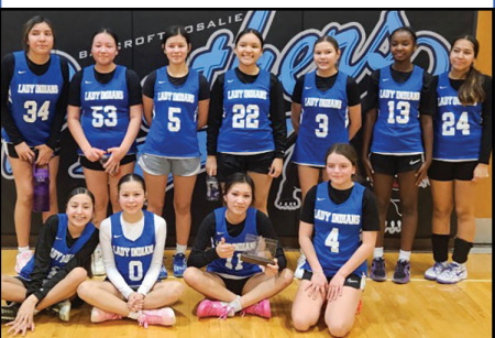
Congratulations to the Lady Indians JH basketball team for winning the BR Tourney! January 25th

January 22nd, Ho-Chunk Renaissance hosted a family game night played in the HoCak Language. Booths were set up with carnival/board games, henna painting, face painting, a pair of magicians and a balloon artist. This Family friendly event was made possible with the help and donations from Human Services 'Nikjak Wakacar Sacred Children Care Center' and HoChunk Inc.