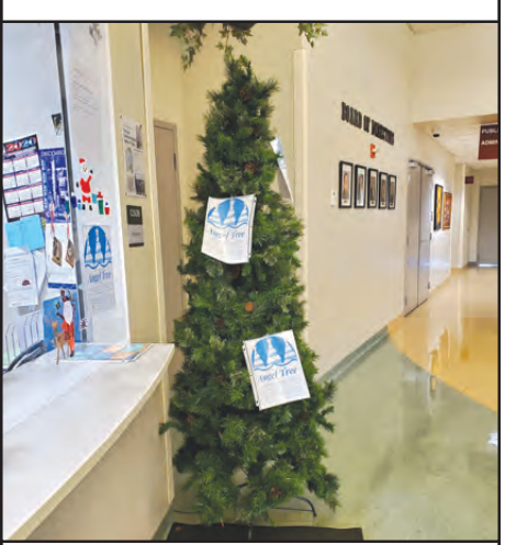
There is still time to sponsor a child for the Angel Tree Toy Drive! Two Angel Tree locations in Winnebago, outside of the Winnebago Dental Clinic and in the Blackhawk Community Center lobby. Sign up with the receptionists!