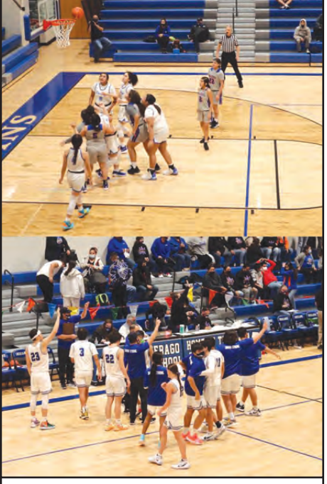
Congratulations to both Winnebago Public High School basketball teams for their home game victories over the Walthill Blujays on Friday, December 4th.