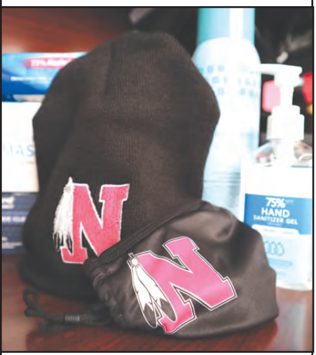
Community Wellness Event on Wednesday, December 9th in Winnebago, where community members received this awesome hat & mask for making a pandemic pledge to: Wear a mask, Wash your hands, Watch your distance, and Stay home!