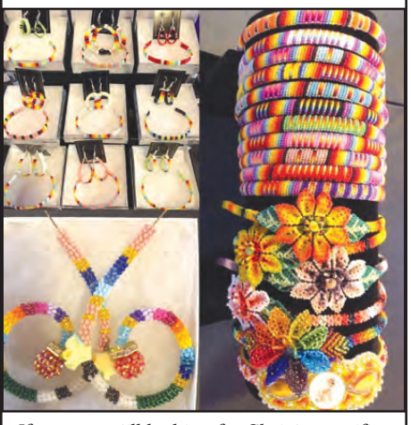
If you are still looking for Christmas gift ideas, go check out some of the custom beadwork available at Hey Hey Girl Beads & Creations! (You can view some merch on their Facebook page: Hey Hey Girl Beads & Creations)