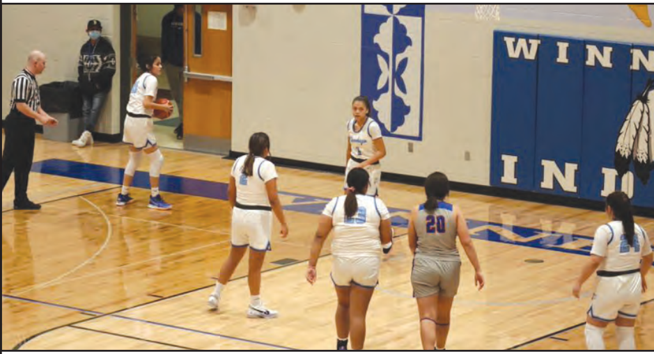
2020 High School basketball: Bago vs. Walthill