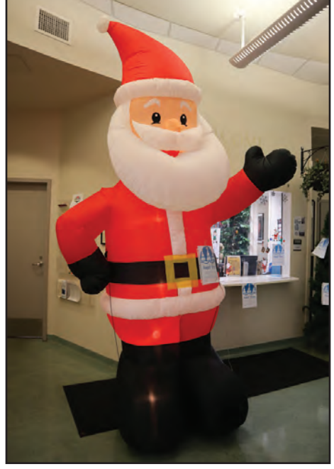
A large inflatable Santa Claus was located near the Angel Tree by the Winnebago Dental Clinic.

If you are interested in sponsoring a gift for a child, visit www.facebook.com/WbagoPHD and select a photo of one of the tags by commenting your name. Once you chose a child, bring your unwrapped present for the child to the Winnebago Dental Department no later than Wednesday, December 16th, 2020. Thank you for the help in making our community's children have a great Christmas!