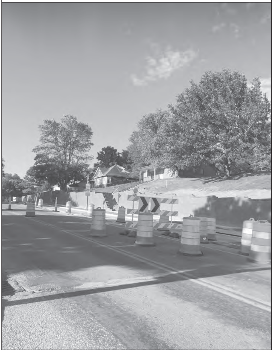
Progress is reflected in the photos shown above from the Main Street construction zone, taken only 2 days apart.