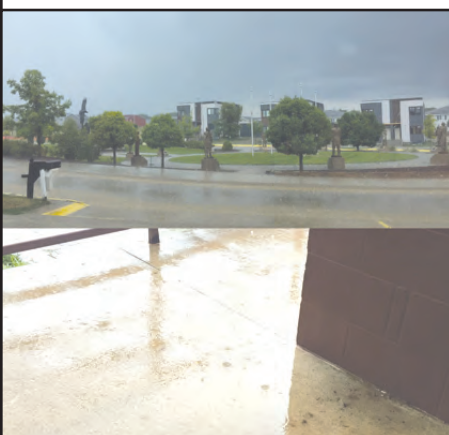
The thunderstorm from Friday, 8/14, had definitely set the bar high for any following storms to come. Winnebago was long overdue for a good storm; we even got a little bit of hail!

Published Bi-Weekly for the Winnebago Tribe of Nebraska • Volume 49, Number 17 • Saturday, August 22, 2020