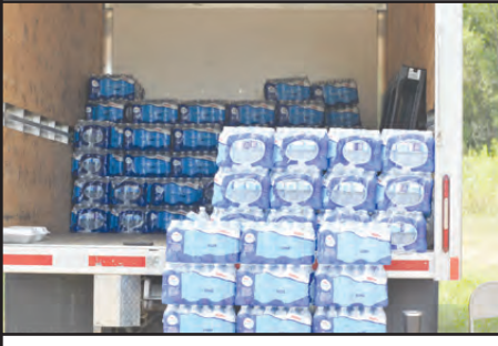
Thank you to ATLAS of Winnebago for their continued efforts in distributing all of the bottled water, boxed goods, and other necessities to the community. Your hard work is greatly appreciated by many!