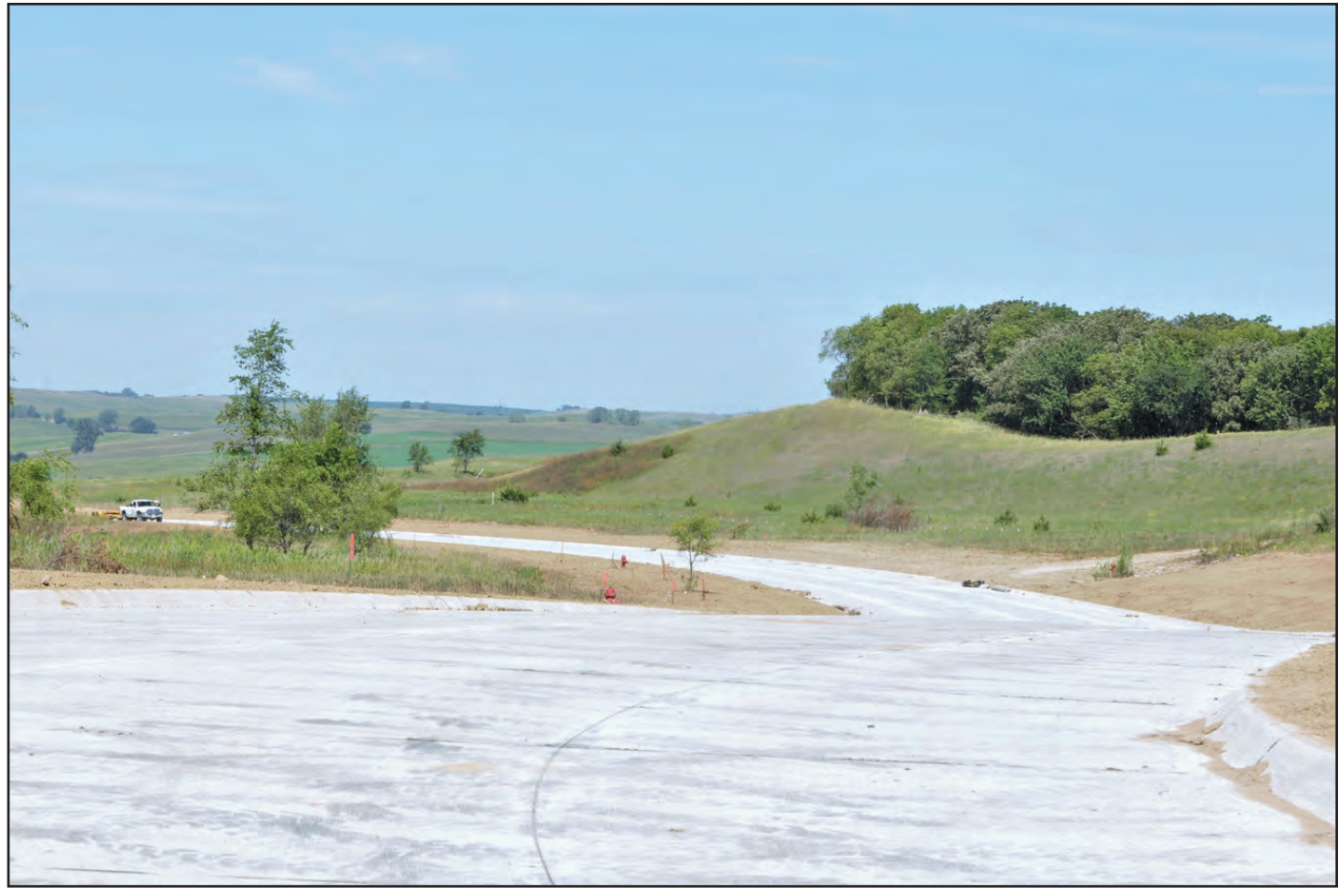
The quarantine housing project is the biggest project funded by the CARES Act money. Here is a glance from the top of Big Winnebago Lane at Thunderway where the housing units are being built.