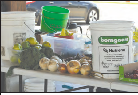
Don't forget to stop by the Ho-Chunk Village Farmers Market in Winnebago, every Wednesday from 1-6 PM. (Located right next to the Dollar General.)