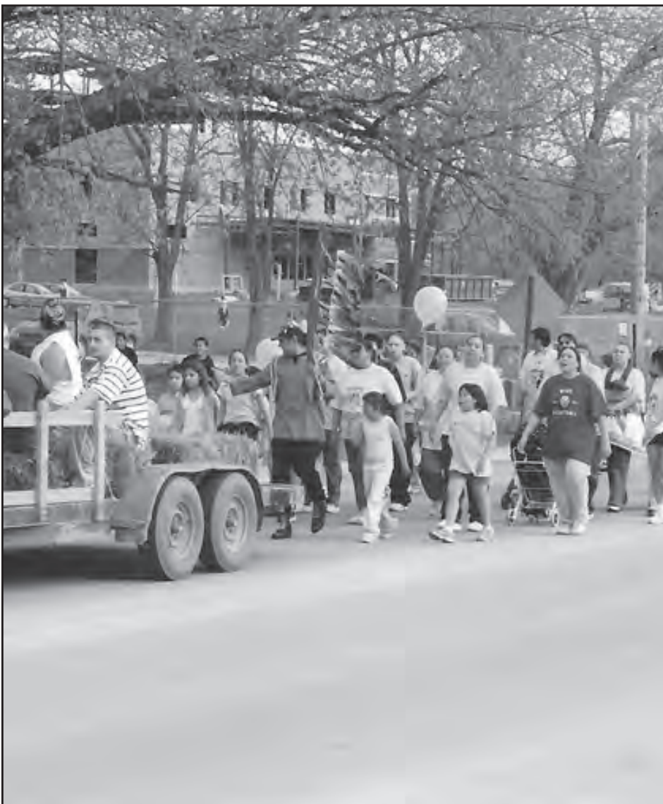
Lots of familiar faces are seen in this photo from a 2002 Walk/Run down main street in Winnebago!