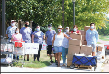
Last week, ATLAS of Winnebago partnered with Partnership with Native Americans to distribute dry goods, bottled water, small portioned toiletries, and other boxed food items. This will take place once a month, more information can be found on the ATLAS Winnebago Facebook page.