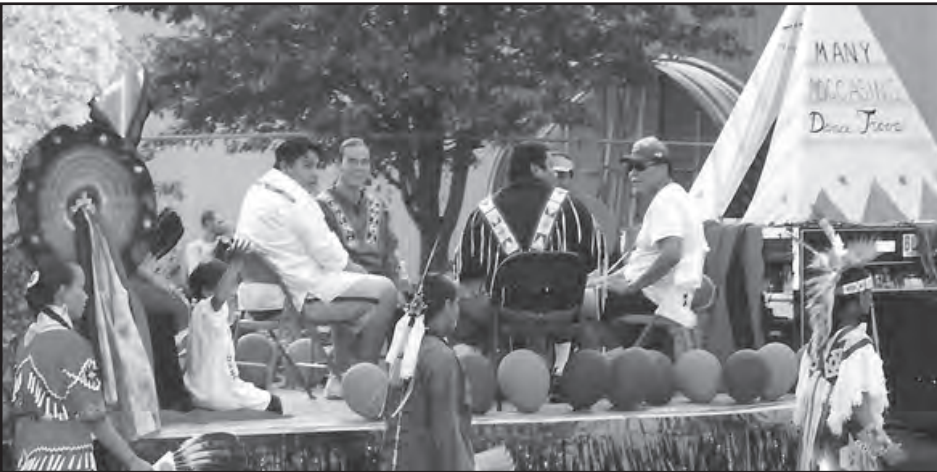
Many Moccasins Dance Troop and their stunning float for an early 2000's Parade in Sioux City, IA.