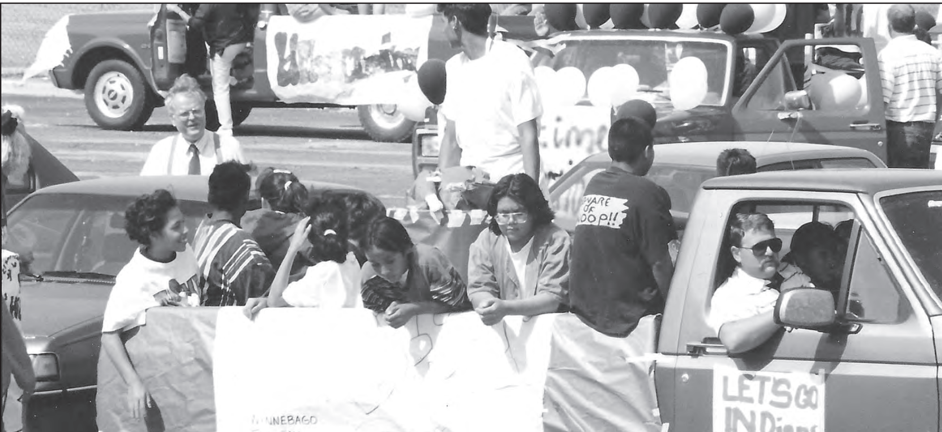
Winnebago Public School students and staff lining up floats to get ready for the 1994 Homecoming parade.