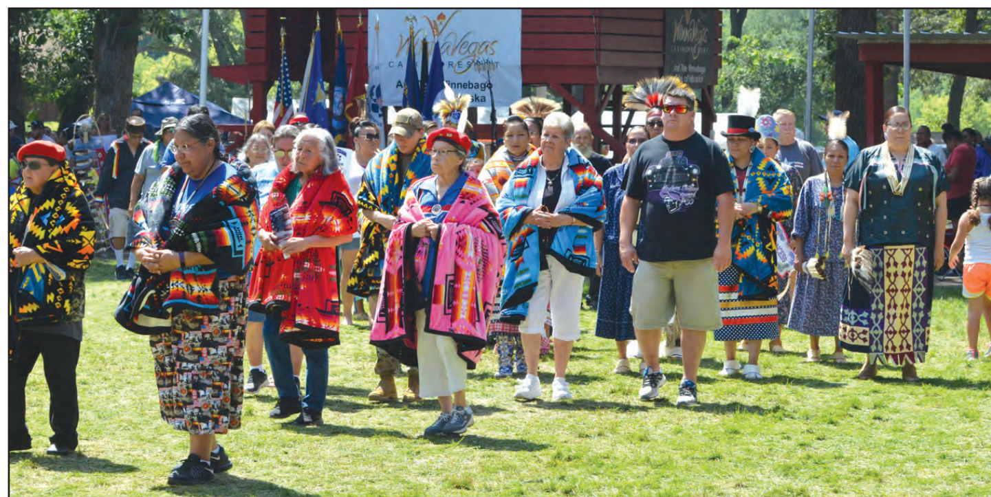
On Saturday afternoon, the Winnebago veteran's held a special honoring for all women veterans that were in attendance at this years celebration. All the women veterans were gifted with a blanket along with a honor song to commemorate their sacrifices in the armed forces.