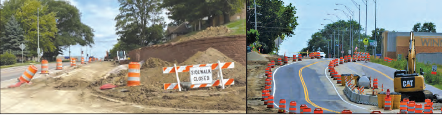
Construction throughout main street is ongoing with progress shown for the retaining walls and pavement, as well as traffic switching sides to allow for the completion of the box culvert.

The Winnebago Tribe of Nebraska has embarked on some notable projects within the community. August 2020 Construction updates include: