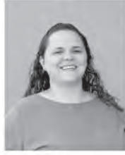
Sierra Big Fire Ho-Chunk Farms