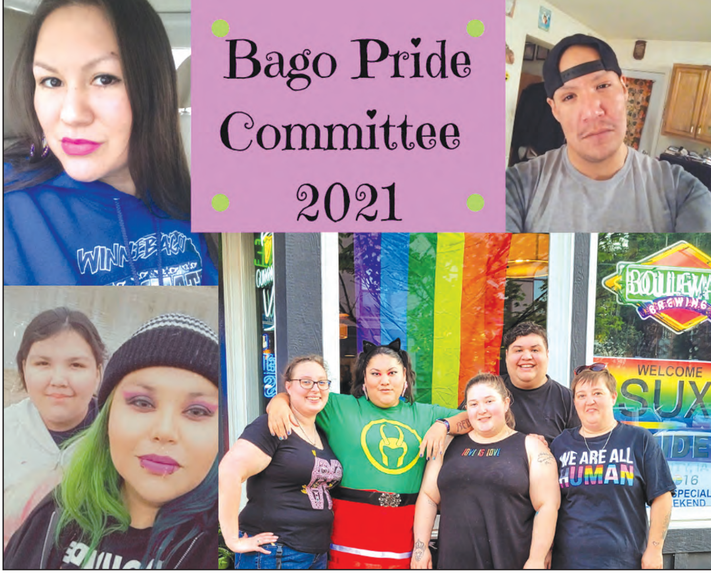
A collage of the committee members of Winnebago Pride.