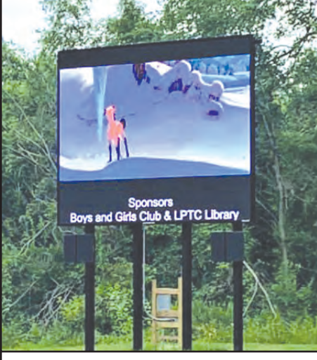
The Little Priest Tribal College Library held their first movie night, No Place Like Home, at the Winnebago LED Screen on Friday, June 18th. The first movie night consisted of two classic movies, "Spirit" and "Home on the Range."