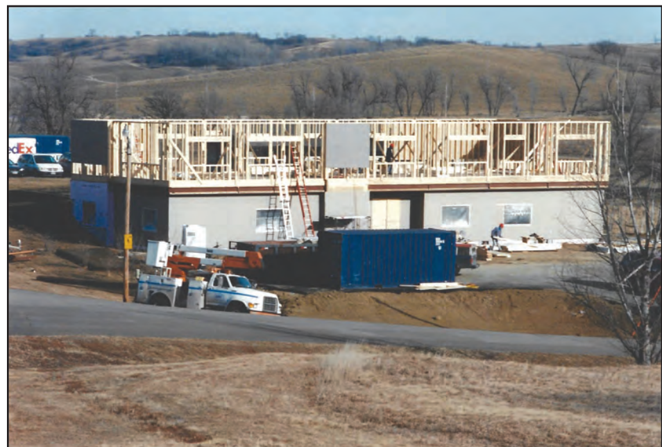
Ho-Chunk, Incorporated in the making.