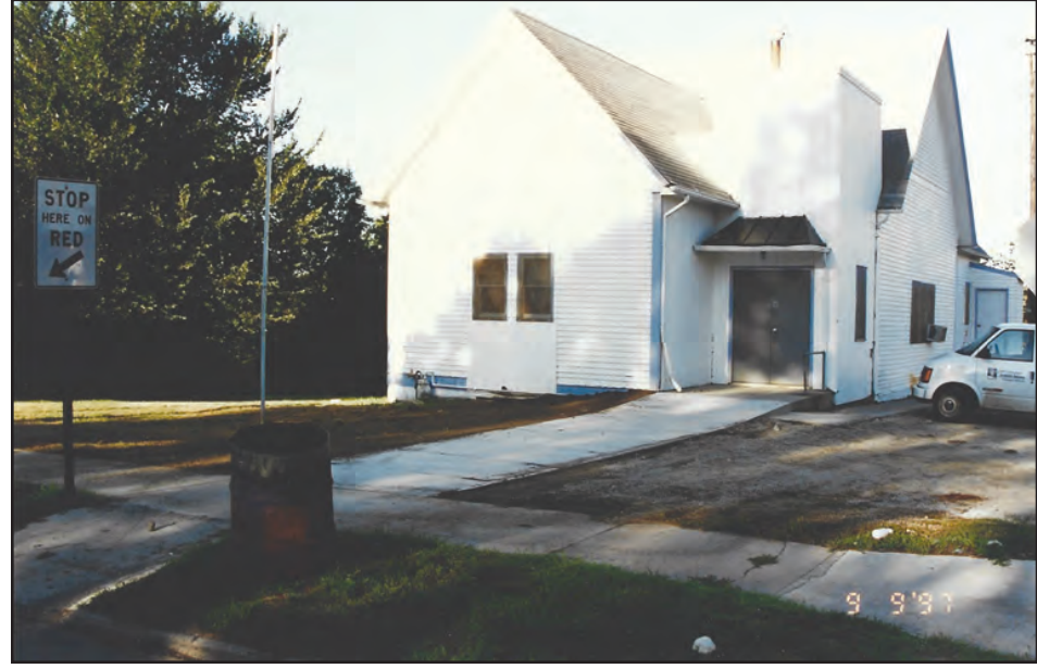
Do you remember this building? Picture taken in 1997.