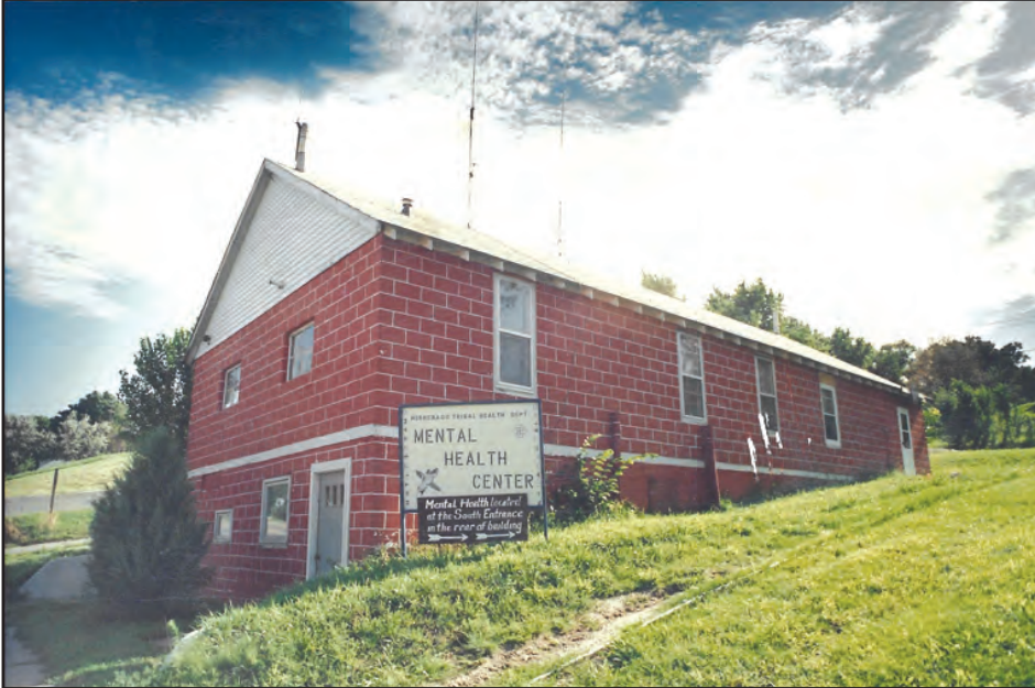
The old Winnebago Tribal Health Department Mental Health Center in 1992.