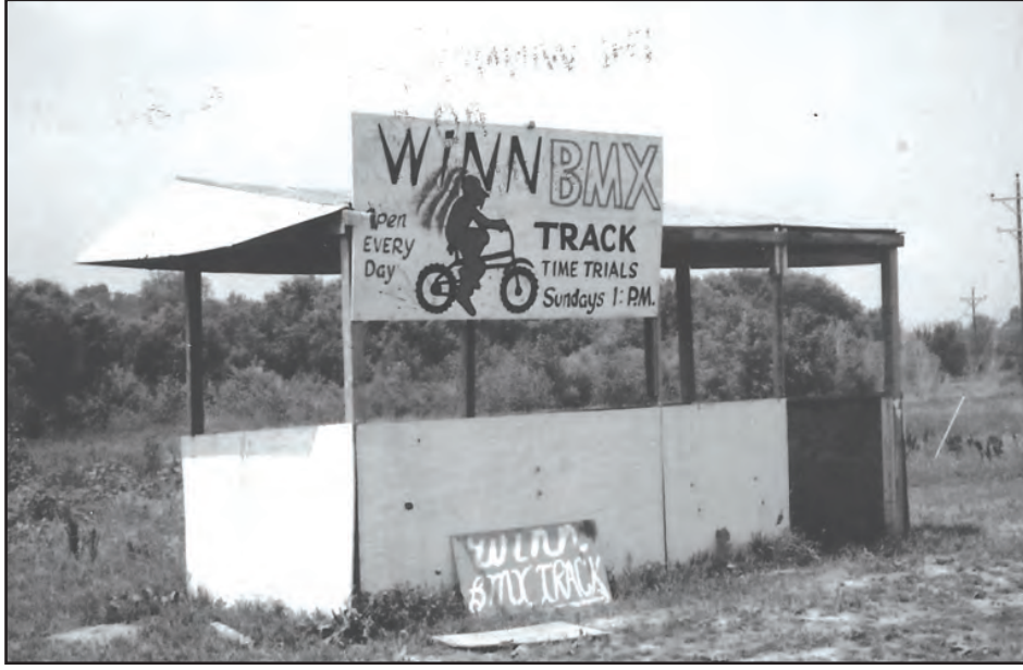
A past time of Winnebago, the WinnBMX Track.