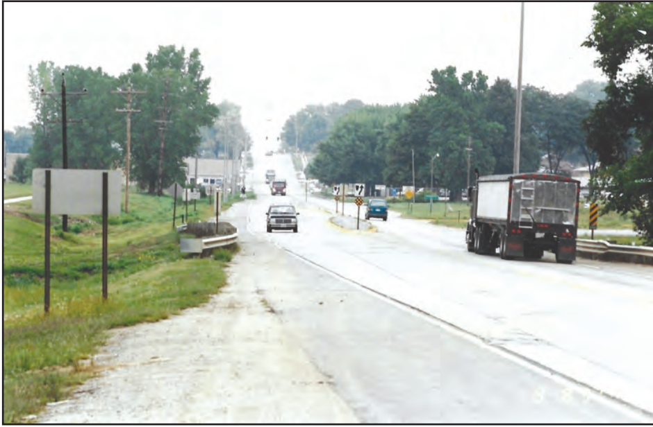
Pictured in September 1997, this is now the location of Winnebago's first roundabout.