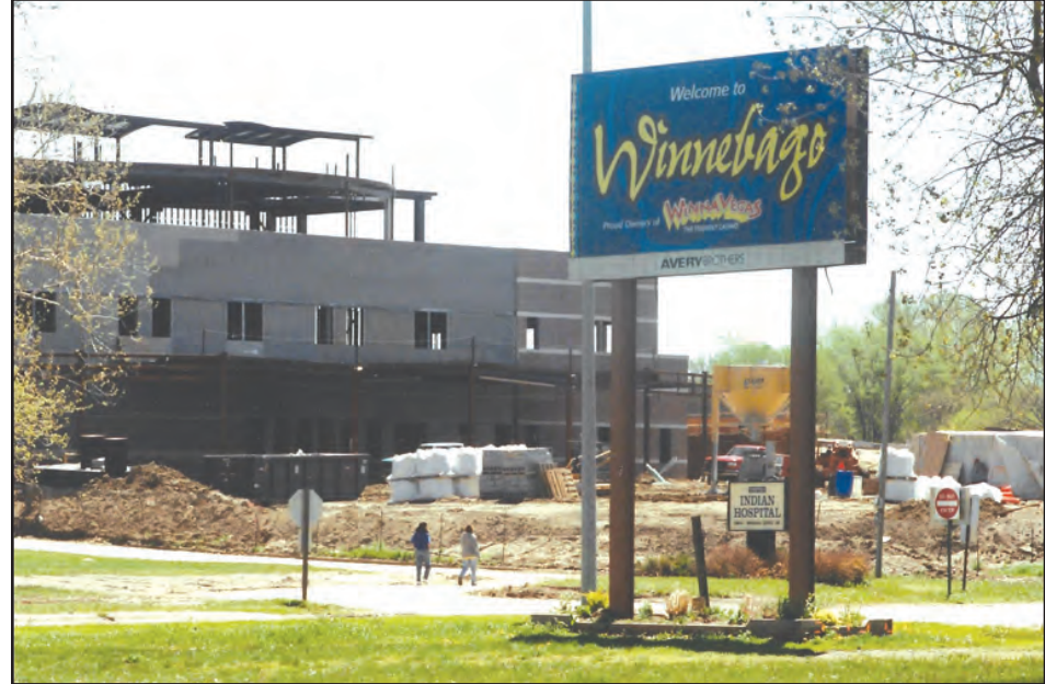
Under construction: Twelve Clans Unity Hospital.