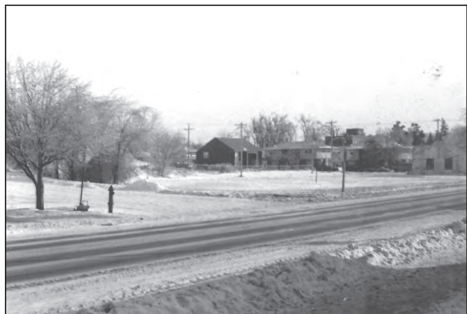
A throwback view of downtown, before "the Slab."