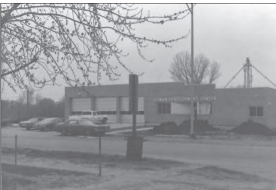
The Winnebago Police and Fire Department building was once the building location for the Human Development Center.