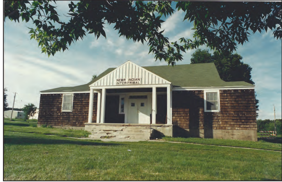
Nebraska Indian Inter-Tribal building.