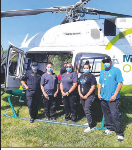
MercyOne Air Med stopped in Winnebago last week to demonstrate their new helicopters capabilities and provide education and training to the Winnebago Fire Department and the Winnebago Emergency Medical Services.