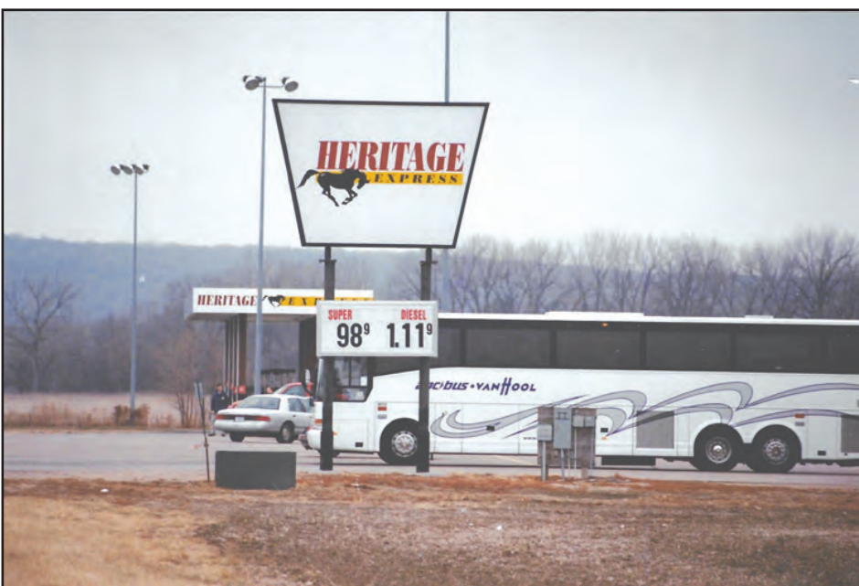
The year of this photo is unknown, but we could not pass up the opportunity to share this memory of gas being at the low cost of .98 CENTS!?