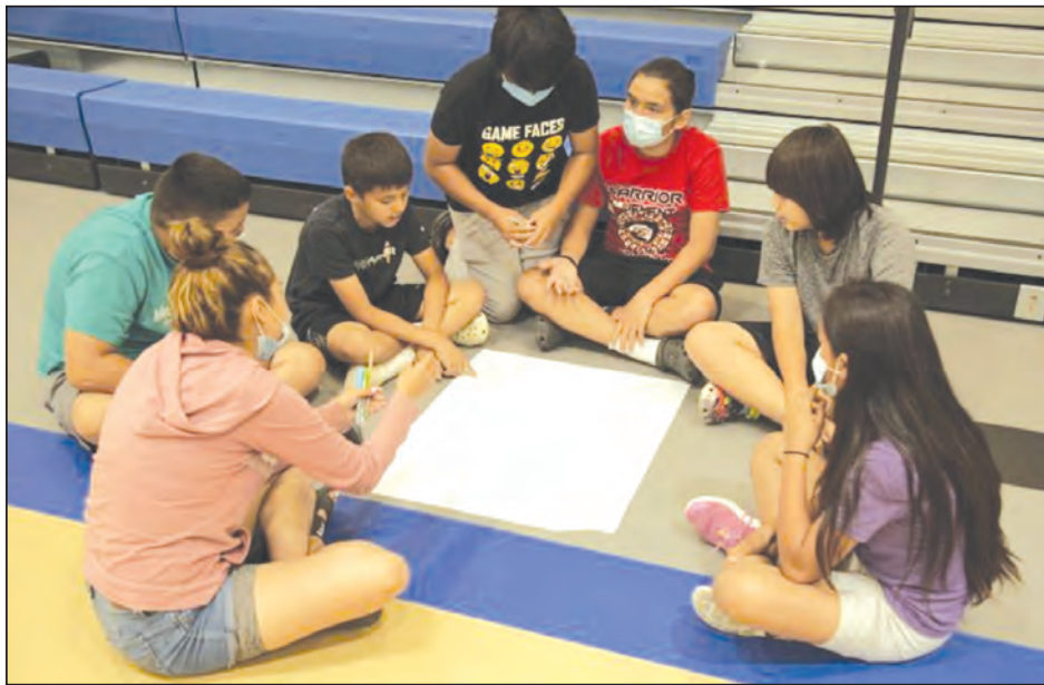
Students attending the Leadership Summit Day 1. Each student is sharing their joys, needs, values and strengths.