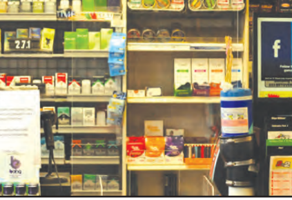
The Pony Express and Heritage stores are putting safety first with the newly installed plexiglass barriers at the cash register, to protect employees and customers.