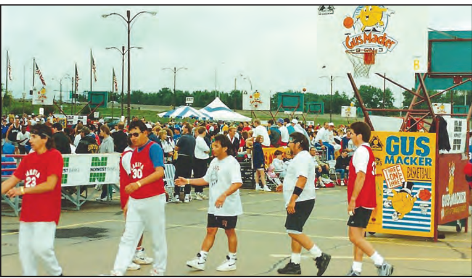
Gus Macker 3 on 3 Basketball Tournament in September 1993.