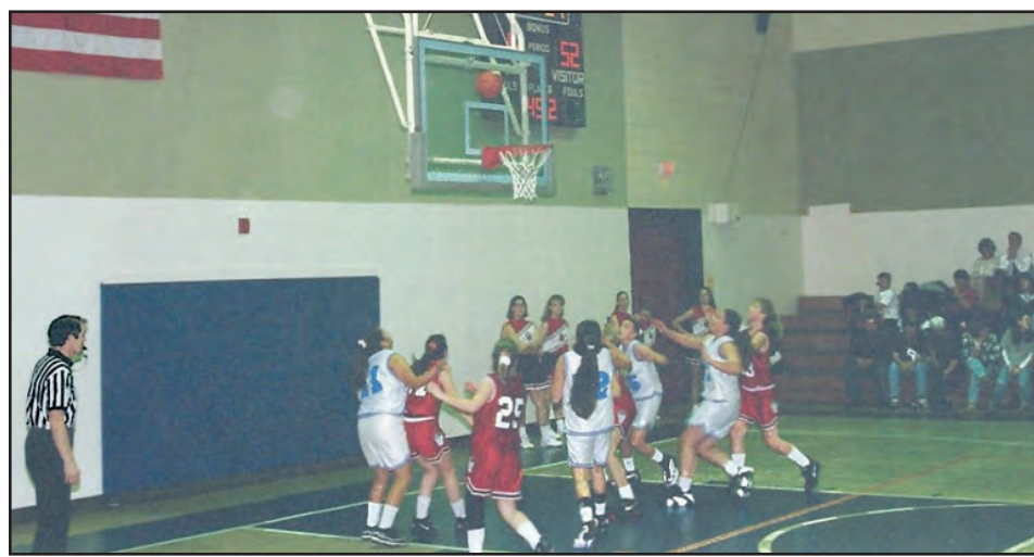
Lady Indians vs. Homer Knights in November 1995.