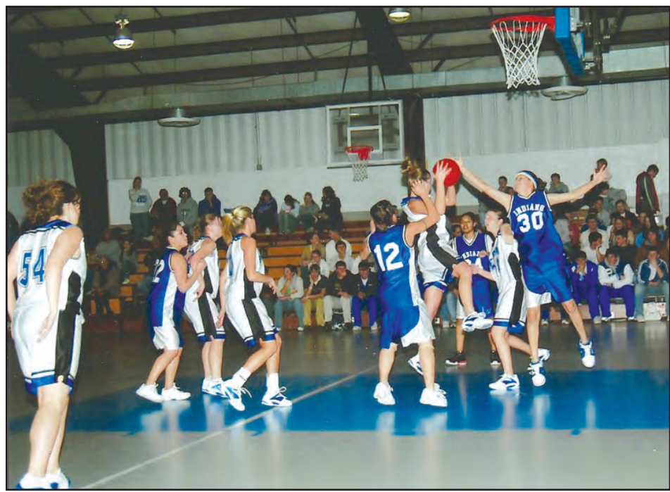
Mid-block shot from a 2005 Lady Indians basketball game.