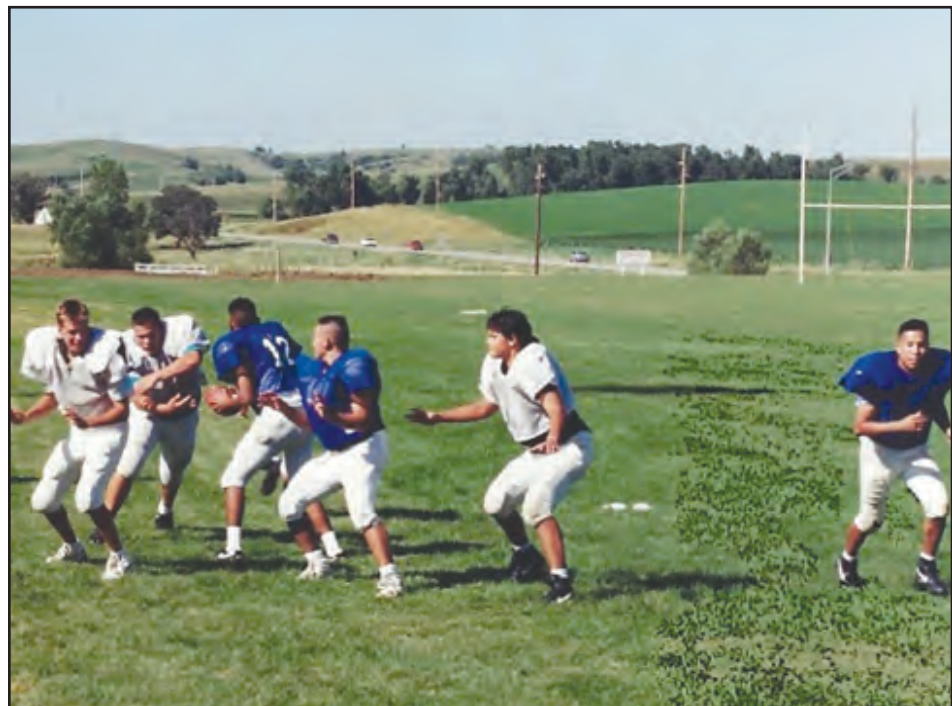
Starting the season off right; a view from a football practice session in 1993.