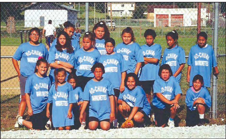
Girls softball team photo from the 90's, The Ho-Chunk Warriorettes.