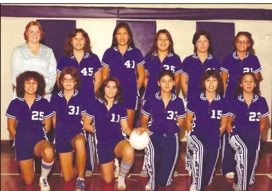
Bet these ladies look familiar; a team photo from the early 80's of the Bago Volleyball girls.