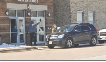
Here's a great visual of our amazing and hardworking staff at Winnebago Public School, bringing meals out to families for pickup. Thank you WPS Kitchen Staff!