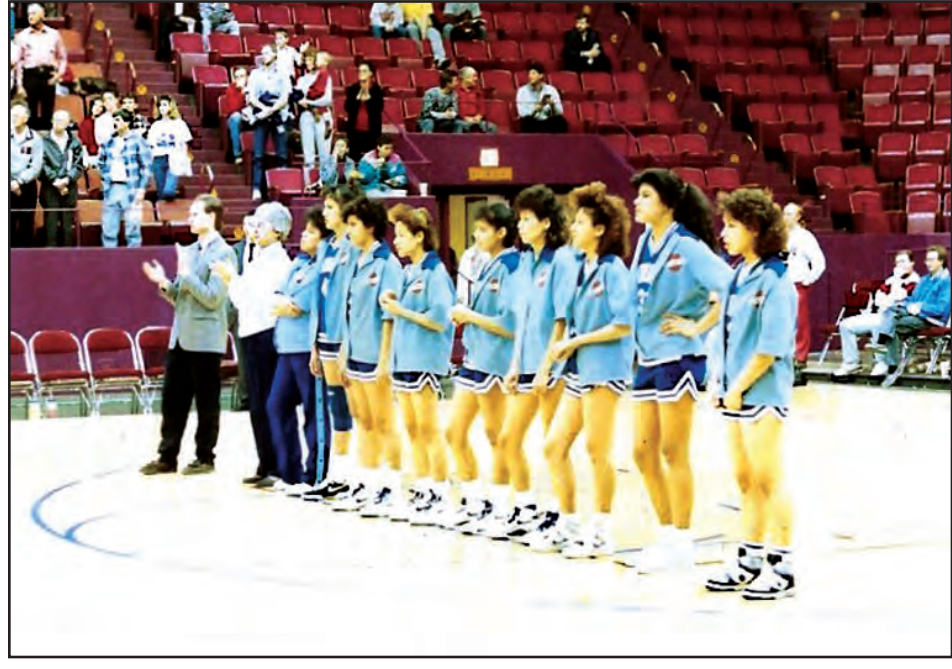
Lady Indians at the State Basketball Tournament in 1990.