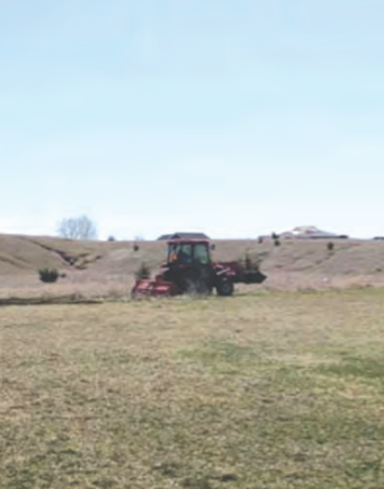
Garden tillage has begun! Ho-Chunk Farms is here to help; all you've got to do is stake out your area and make space available to fill. For more info, reach out to Isaac Smith & Aaron LaPointe.