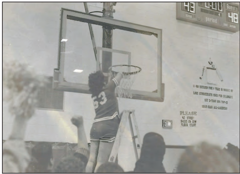
Lady Indians take the net after a win, (Bago 48 - Lynch 43)