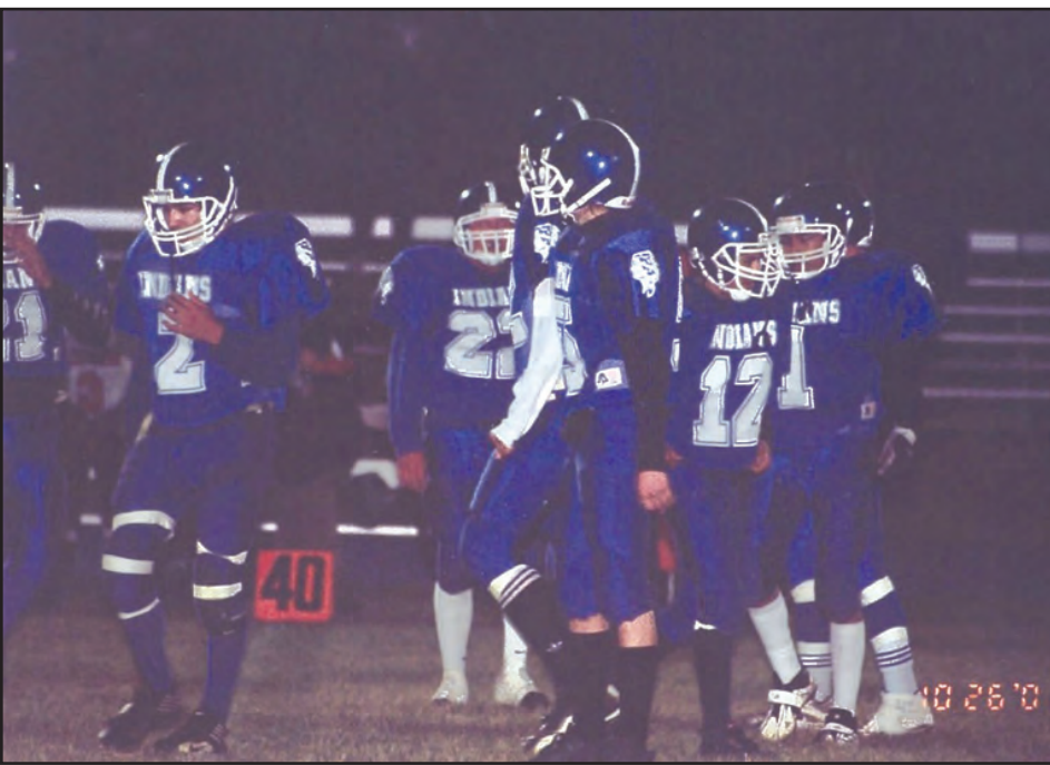
Game night view of the Bago Boys football team in October 2001.