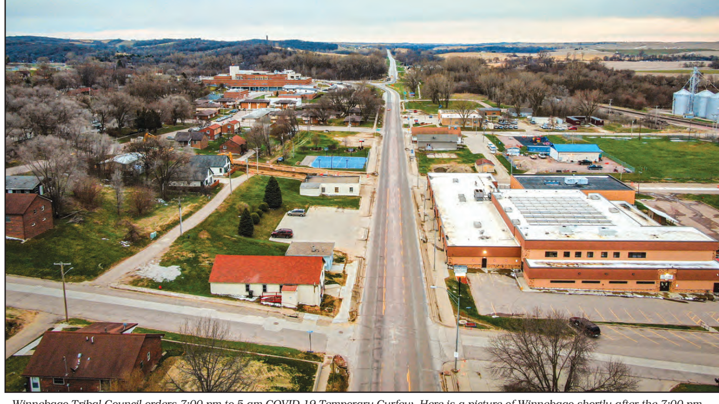
Winnebago Tribal Council orders 7:00 pm to 5 am COVID-19 Temporary Curfew. Here is a picture of Winnebago shortly after the 7:00 pm siren sounded on Wednesday, April 15, 2020 turning Winnebago into a ghost town. Stay home Stay Safe!

Winonah Leader Charge Numerous tribes across the nation have initiated the implementation of curfews within their communities. Implementing curfews is a proactive approach to protecting and combating against the Coronavirus. Fortunately, there has been no cases of COVID-19 in the Winnebago community, although there has been confirmed COVID-19 cases in neighboring communities.