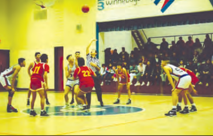
Here is a nice shot from the 1990-1991 Bago Boys Basketball Season. Do you enjoy looking back in time? More throwback photos on page 7.