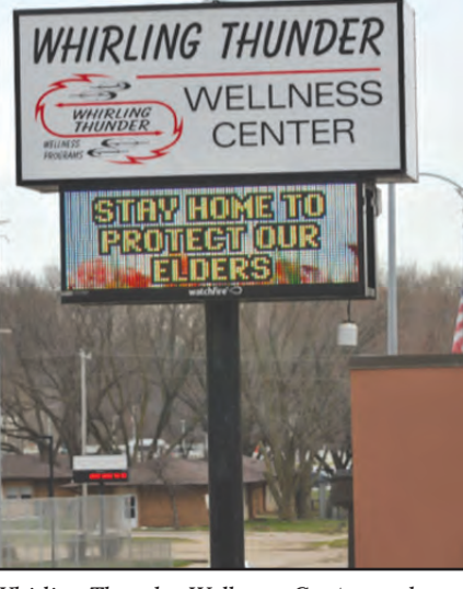
Whirling Thunder Wellness Center and LPTC have updated their LED signs, on Main St, with a reminder to continue practicing the social distancing guidelines and stay home to protect our elders!