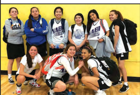
High school girls basketball team SWO recently took 1st Place in a tournament located in Lincoln, NE.