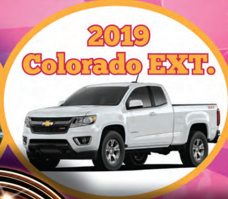
2019 Colorado EXT.