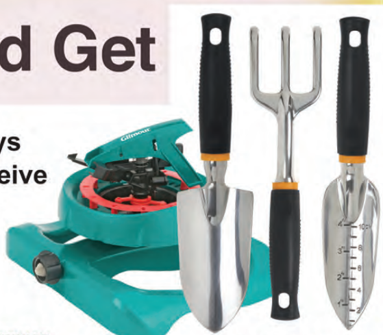
SPRINKLER APRIL 14 & 15

*Picture shown may not represent actual items. Supplies limited.