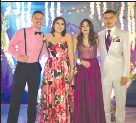
The WPS high school danced the night away this past weekend at the annual school prom.