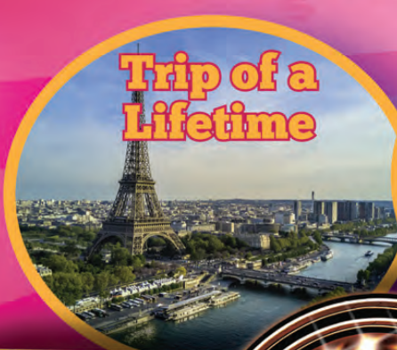
Trip of a Lifetime