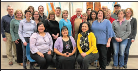
Warren Buffet recently came to visit the HCI headquarters and visit the HoChunk Inc. properties.