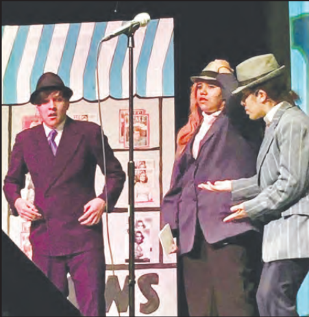
Winnebago high school students had a great performance of the "Guys & Dolls" play rehearsed for the community.