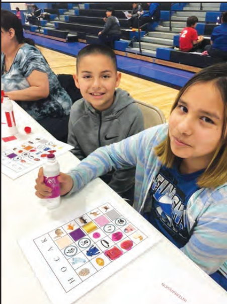
HoChunk Bingo was a fun event for the community members of all ages. Very few in attendance went home empty handed.