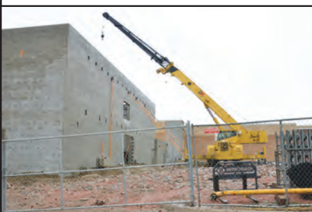
The new multi-purpose room and additional classrooms are expected to be completed in the month of August.