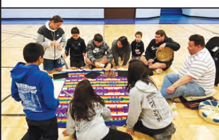
NSCVQ Moccasin Game Tournament held last week at the Whirling Thunder Wellness Center.