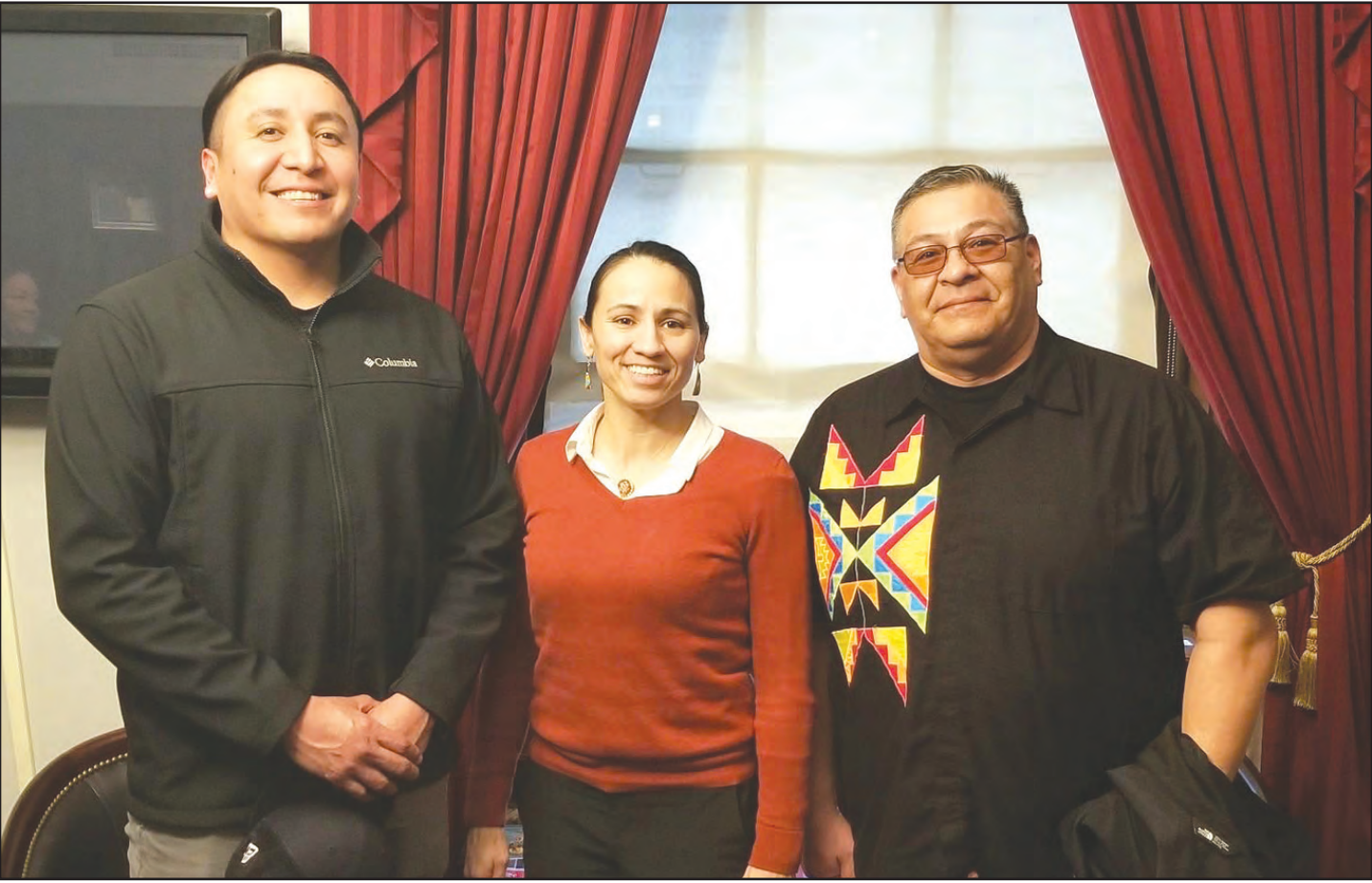
HCI Board members and TC representatives to attend a ribbon cutting and open house for the new All Native Group office building in Fairfax, VA. All Native Group is Ho-Chunk, Inc.'s largest division. The group employees about 1,200 across its network of businesses in federal government contracting.