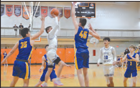
Bago boys fall short in sub-districts game against the Logan View Raiders losing 51-59.