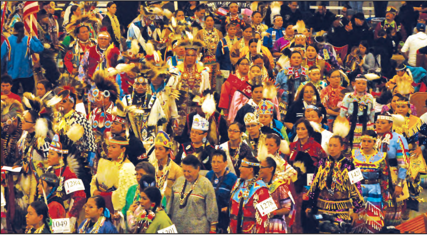
With this being the 2nd year for the Last Bear Moon Powwow, there was an increase in the attending dancers and singers, as they crowded into the WinnaVegas Event Center, on Saturday, February 29th. It was an event to remember for all who came. There were even a couple "celebrity" dancers and singers who participated. The team behind the scenes did an awesome job. The invited tribes definitely felt welcomed along with the gifts from the tribal leaders to take home to each of their families. If there's a 3rd annual Last Bear Moon powwow next year, could there be an additional day, we shall see.