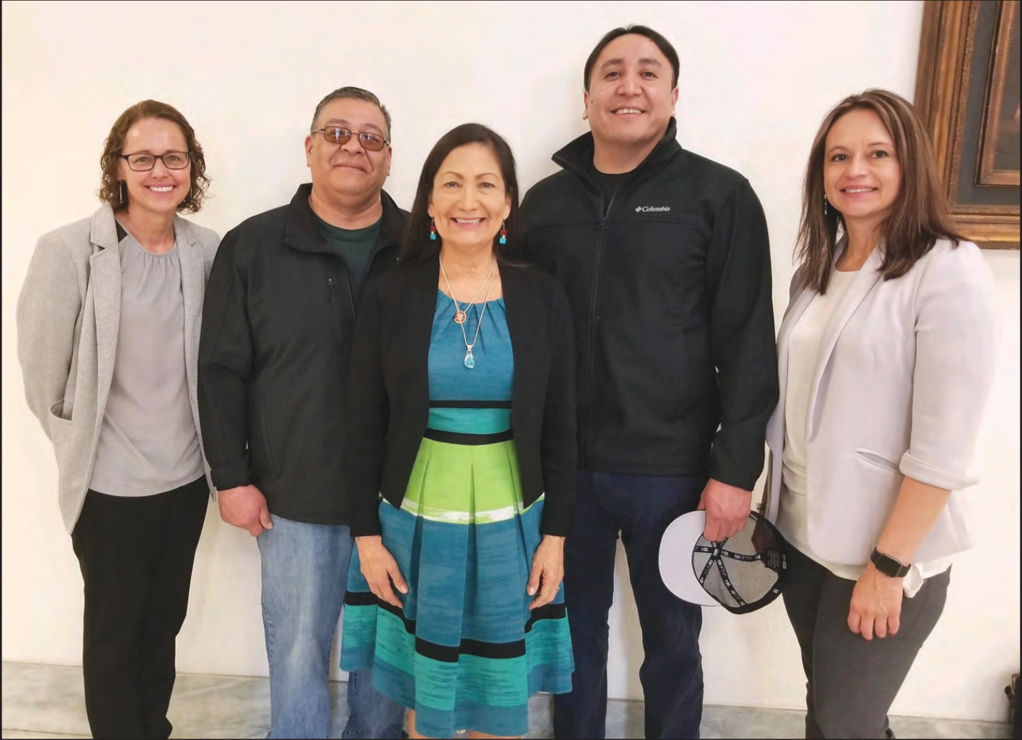
Winnebago Tribal Council representatives met with members of Congress to discuss issues of importance to the Tribe, including land condemned by the Army Corp of Engineers in the 1970's. The Tribal Council has been advocating for the passage of a bill by Congress to return the land to the Tribe.