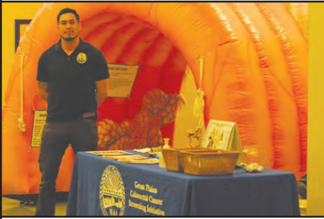
March is the awareness month for Colorectal Cancer Screening. Hurry down to Twelve Clans Unity Hospital to get yours checked.