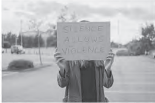
Winnebago Youth Crisis Intervention Center and Youth Shelter