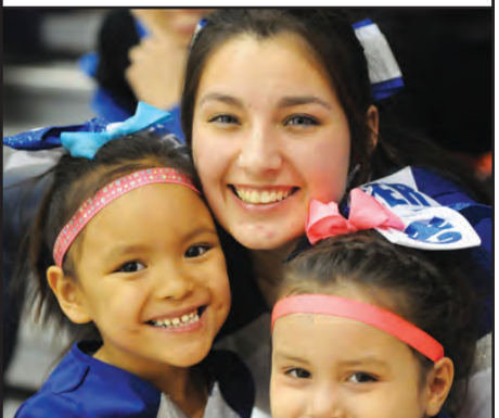
Winnebago Cheerleaders take a Time Out between cheers just to pose for the WIN camera.