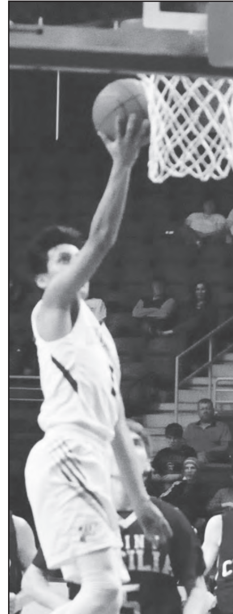
The Indians traversed to Grand Island, Nebraska again this year for the Heartland Hoops Classic. This year taking on #1 rated Class C2 Hastings, St. Cecelia who are defending State Champs. The Indians answered a request made at the State Tournament last year when St. Cecelia was wanting “WE WANT BAGO,” well they got Bago’d, 76-61.

New Deadline !!! for Winnebago Newspaper March 3