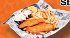
2 piece Fish and Ships