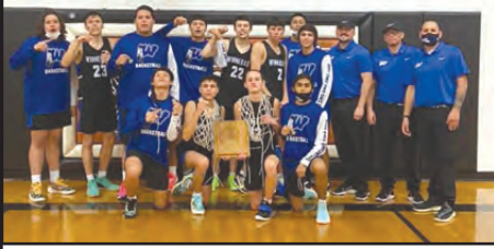
Congratulations to the Winnebago Boys Basketball team on their 2020-2021 Lewis and Clark Tournament Championship!!! #BagoPride