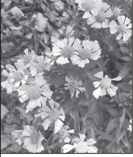
Kathleen Cue, Nebraska Extension Educator in Dodge County

Annual and Perennial Flowers Growing a vegetable garden versus growing a flower garden can be hotly debated. Vegetable gardeners ask, "What good is it if you can't eat it?" Flower growers think if it is not pretty, what's the point? For me, growing both vegetables and flowers are necessary—vegetables nourish my body while flowers feed my soul.