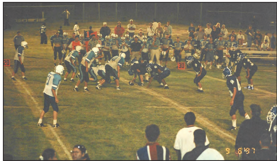
Winnebago Indians Football, (September 1997)