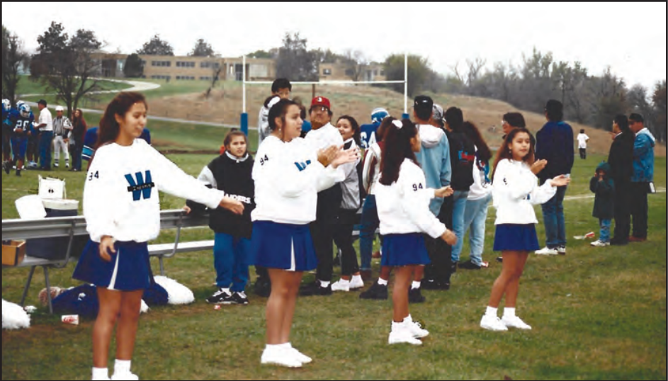
1993 Winnebago Indians Cheerleading Squad also pictured during the Homecoming Football Game.