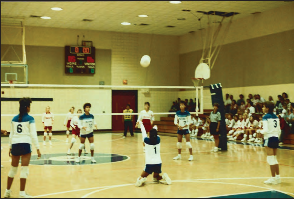
Winnebago Lady Indians Volleyball home game in 1989.