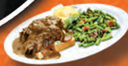
Open Faced Hot Beef Sandwich With Gravy