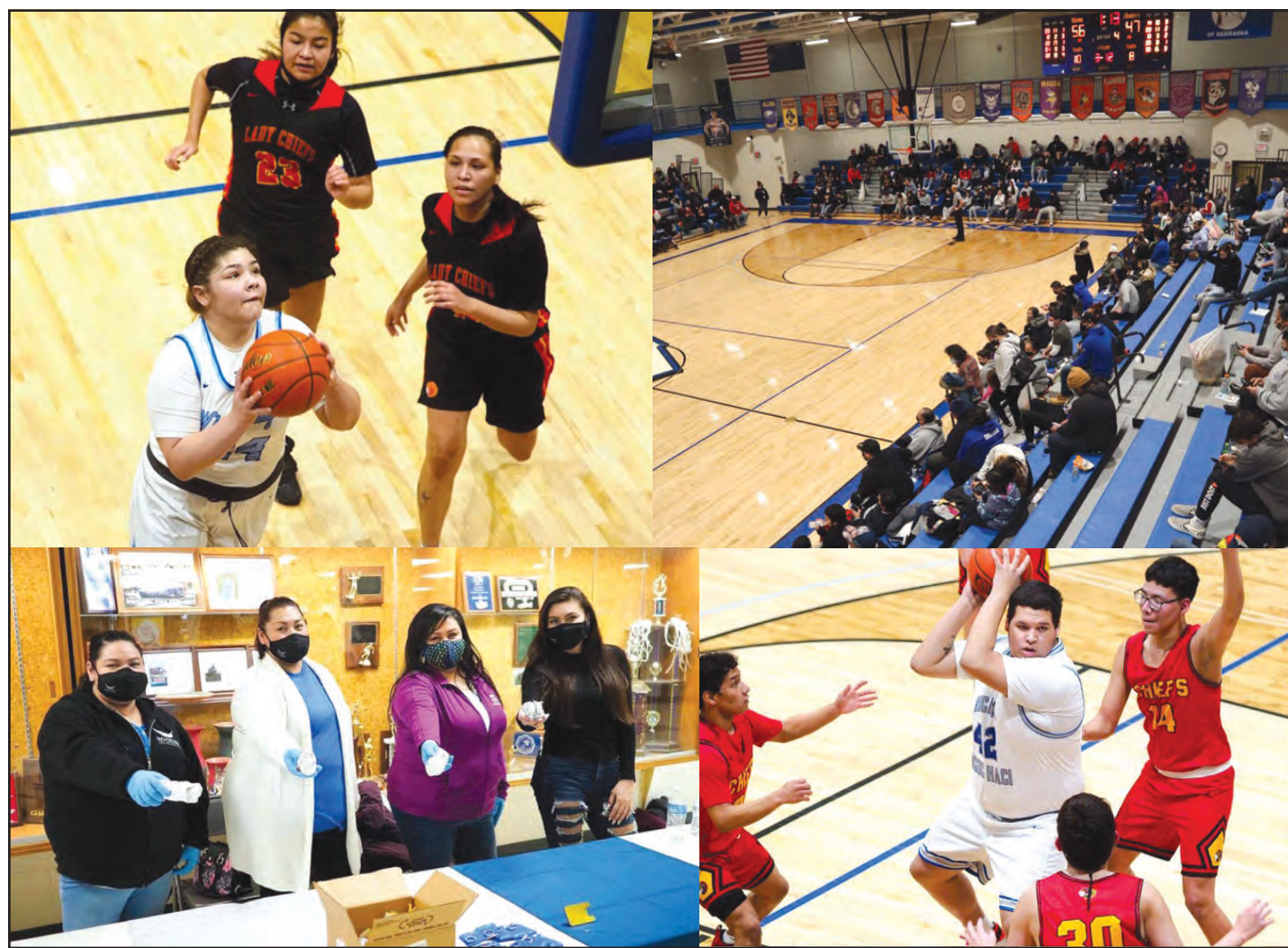
On Thursday, February 11 th, a match-up between Winnebago and Omaha Nation was held at Winnebago Public School.

Go Big Blue! Huge thanks for everyone who turned out and joined online for Fan Appreciation Night at Winnebago Public School. The event was sponsored by Ho-Chunk, Inc.'s Community Impact & Engagement team.