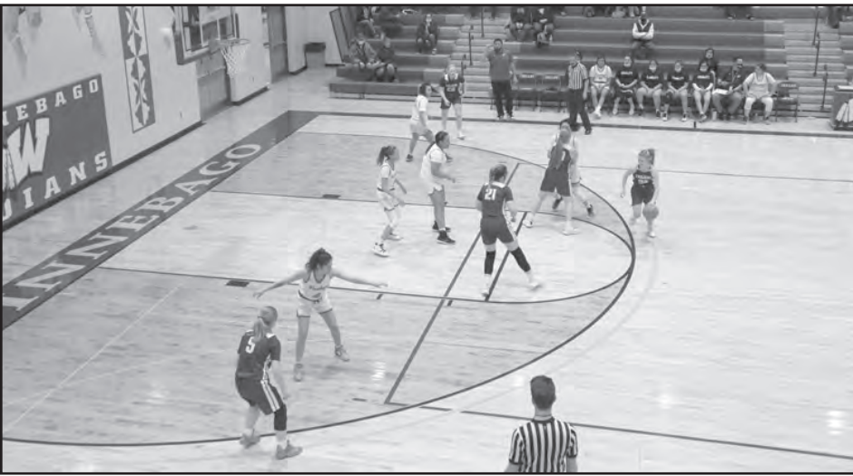
Varsity Girls Basketball home game on February 9th Lady Indians vs Lady Wakefield