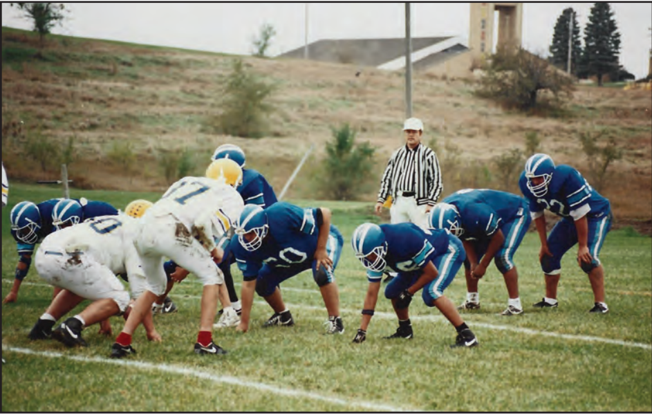
Homecoming Football Game: Indians vs Allen (1993)