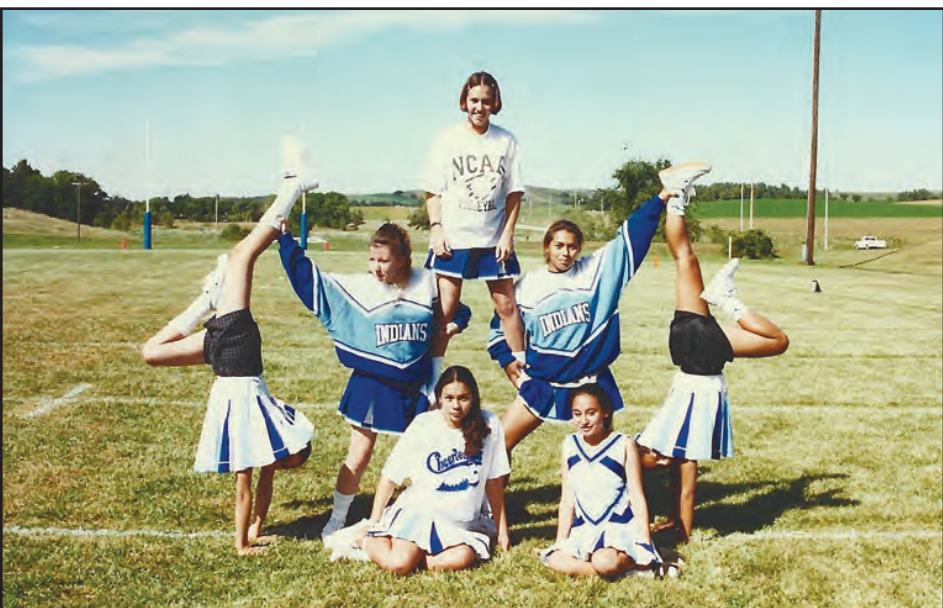
Winnebago Lady Indians Cheerleading Squad