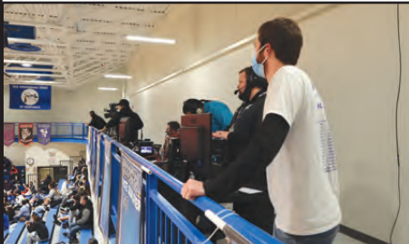
A behind the scenes look at the production crew hard at work during February 11th's live streamed event for Winnebago High School's basketball home game against the Omaha Nation Chiefs.