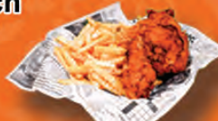
2 piece Broasted Chicken Basket