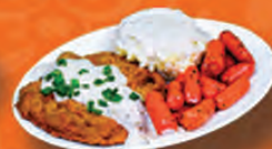
Country Fried Steak