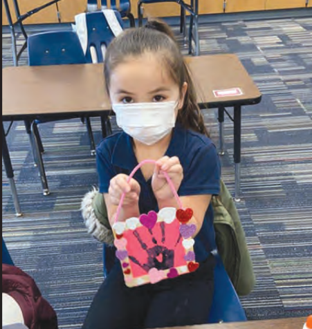
The Boys and Girls Club of The Hōcāk Nīšoc Hacı's Facebook page shared a few photos from their fun Valentine's Day party project!