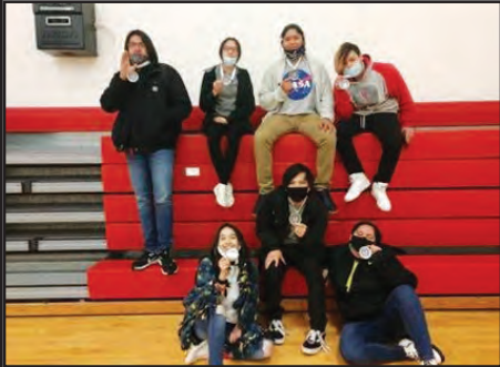
Congratulations to Winnebago's Speech Team on their medal winnings at the Homer speech meet!