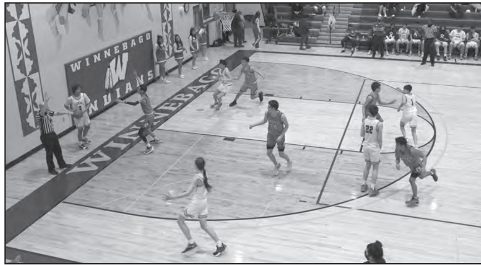
Varsity Boys Basketball home game on February 11th Indians vs Wakefield