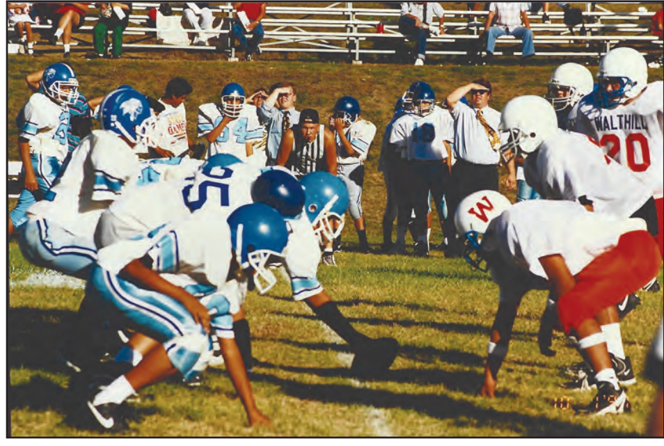
Winnebago Indians Football home game vs Walthill Blujays, (October 1997)