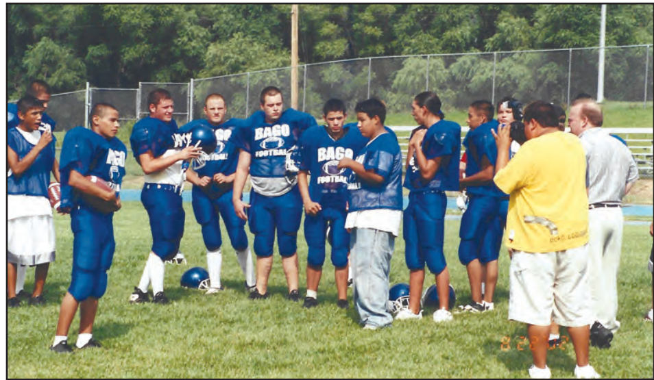
Winnebago Indians Football team, (2002)