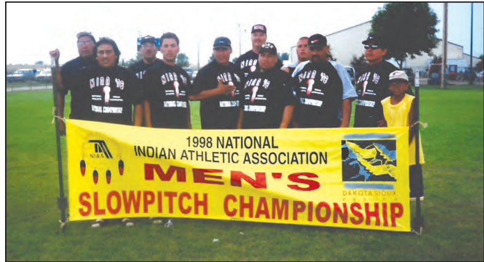
1998 National Indian Athletic Association Men's Slow-pitch Champions!