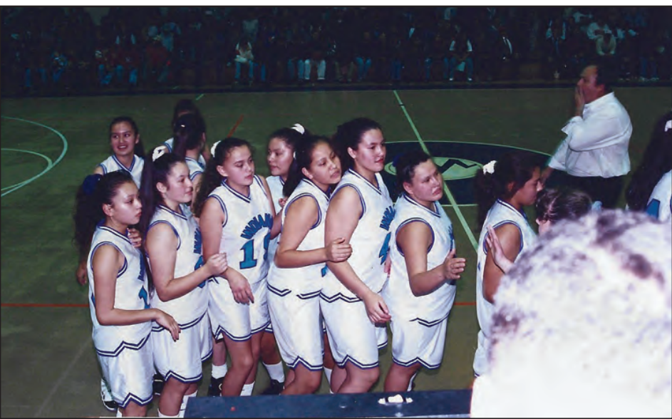
Winnebago Lady Indians vs Walthill Lady Blujays, (December 1995)