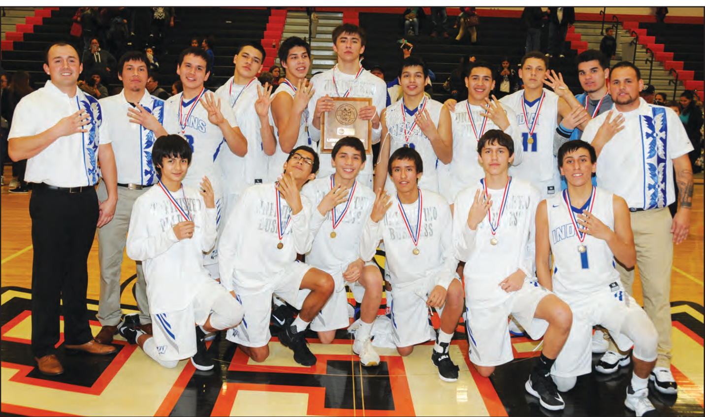
The Winnebago Indians captured another conference Championship last week as they chapped up Class C-2 #2 rated Ponca Indians. The Indians snapped up Ponca once before in The Swamp, 60-57, but lost to Ponca, 53-48 on their home court in Ponca. The Indians left no doubt in the L&C conference championship game winning 51-41, at The Cave, in Laurel, Nebraska. Go Big Blue. The Indians are home this Friday, and sub-districts start next Tuesday.