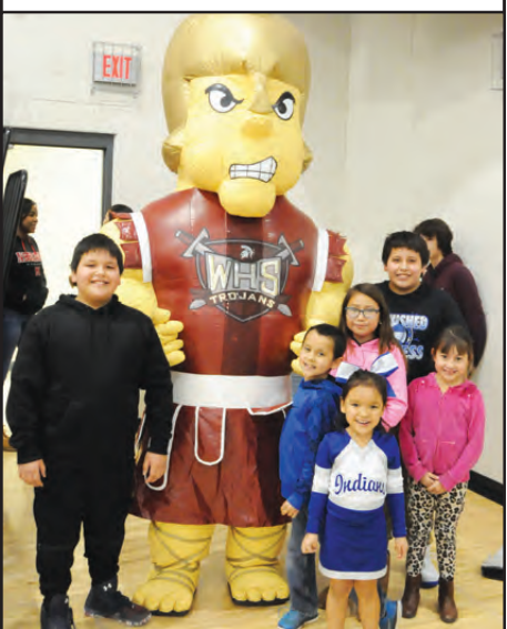
The Indians hosted the Wakefield Trojans last week for Senior Night. Here's a shot of some Winnebago fans with the Trojans Mascot.