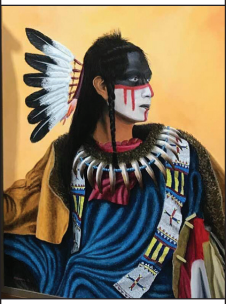
Winnebago Model Xerxes Long posed for this artists rendering that is abound the newly commissioned U.S.S. Sioux City.