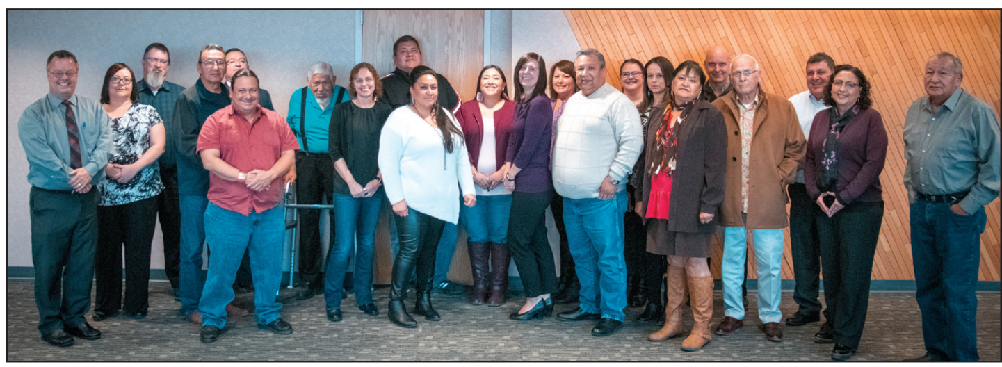
The Winnebago Tribal Council met with leadership from WinnaVegas, Ho-Chunk, Inc. and the Winnebago Comprehensive Healthcare System. This was the first such meeting and helps establish an ongoing opportunity to share information among the Tribe's major organizations and the council. Participants hope this communication will lead to increased efficiency and collaboration throughout the Tribe to better serve members' needs. Topics discussed during this first meeting included status of the Tribe's assumption of the former IHS Hospital, now 12 Clans Unity Hospital, and the timeline for certification by the Centers for Medicare & Medicaid Services. Ho-Chunk, Inc. updated the council on the legal disputes related its tobacco manufacturing and distribution businesses. WinnaVegas leadership provided information on efforts to protect market share and raise revenue in an increasingly competitive gaming market. Discussion items among the whole group included the Tribe's budget challenges, strategies to increase revenue and identifying cost savings. There was an agreement to continue the conversation and working toward those shared goals.