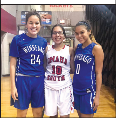
The Lady Indians took their game to Omaha South last weekend to stir up a little trouble for the Lady Packers, the Lady Indians topped their opponents 71-27. GBB!