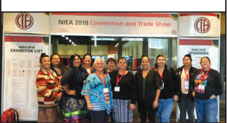
Winnebago representatives at last week's National Indian Education Association Convention held in Hartford, Connecticut.