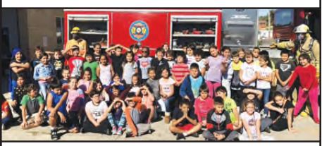
The WVFD sharing their shiny Red Fire Engine with elementary WPS students last week during a rare nice day.