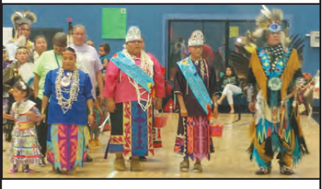
New Harvest Celebration Princesses, at the recent Fall Harvest Celebration hosted by the CDC Tribal Practices for Wellness Partners.