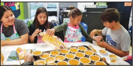
The Boys & Girls Club hosted a "Healthy Cooking for Kids" class the past few Mondays, here they are with some delicious Pumpkin Pie.