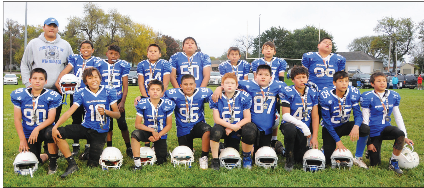
On a hazy Northeast Nebraska day the 5th & 6th Grade boys & girls club football team from Winnebago captured 2nd Place Honors in the Northeast Nebraska elementary football championships. The lil Indians battle ended in heart break for the boys against a cornfed team from Rez Rival, Emerson Pirates. Our lil Indians fought hard all four quarters but came up short on the scoreboard. You will get them next years boys, Go Big Blue!