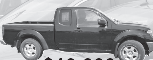
2008 Nissan Frontier