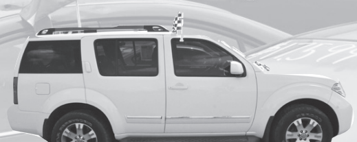
2008 Nissan Pathfinder