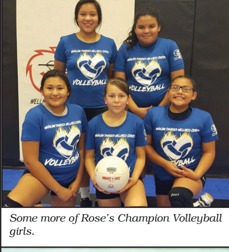
Some more of Rose's Champion Volleyball girls.