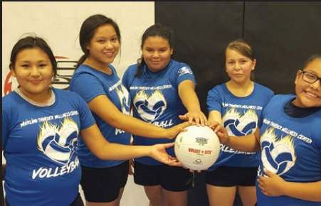
The future of Winnebago Lady Indians Volleyball.