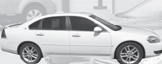
2009 Chevy Impala LTZ