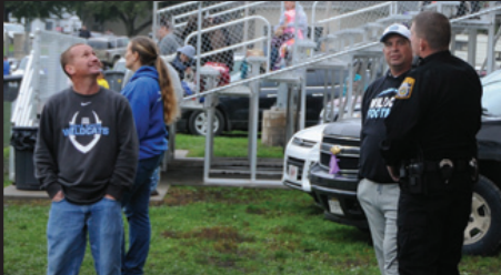
He could've just been a proud parent watching his son play a 5th & 6th grade football game, but, Emerson fans were on the other side of the field and he's a county officer, and the game is being held in Cedar Bluffs, Nebraska. Oh Well.