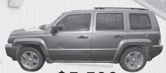
2007 Jeep Patriot