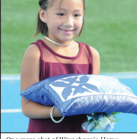
One more shot of Winnebago's Homecoming festivities with Bunny Earth, the Queen's Crown Bearer.