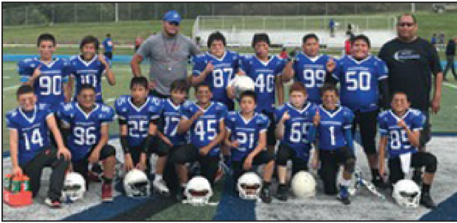
The 3rd-4th grade team is undefeated with games against Omaha Nation, Emerson, and Homer. This past weekend they took on Walthill and won 51-0. They will have their final game of the season on Sunday, October 8 in Cedar Bluffs at 2 pm.