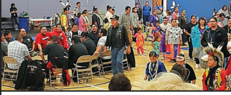
The Winnebago People recently celebrated a good Harvest, pic courtesy of Carmen Snow.