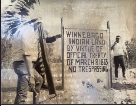
By Treaty of 1865 the Winnebago own land on the Iowa side of the River, we are about to get it all back. Update in the next issue.