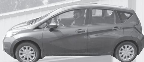
2015 Nissan Versa Note