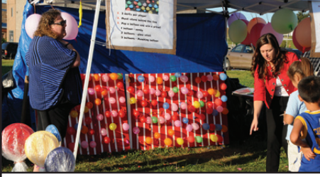
HCI held their Annual Open House last week with a feast and games for old and young alike.