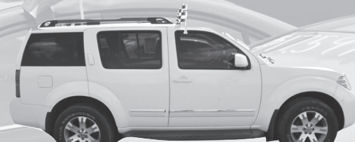
2008 Nissan Pathfinder