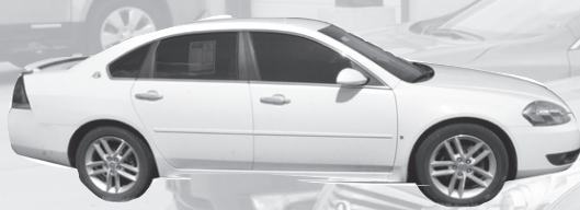
2009 Chevy Impala LTZ