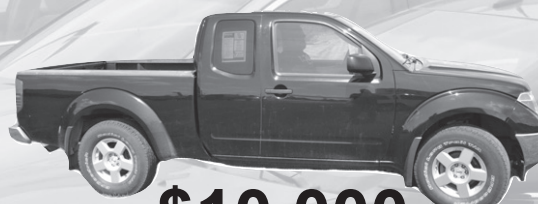
2008 Nissan Frontier