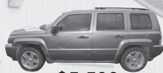
2007 Jeep Patriot