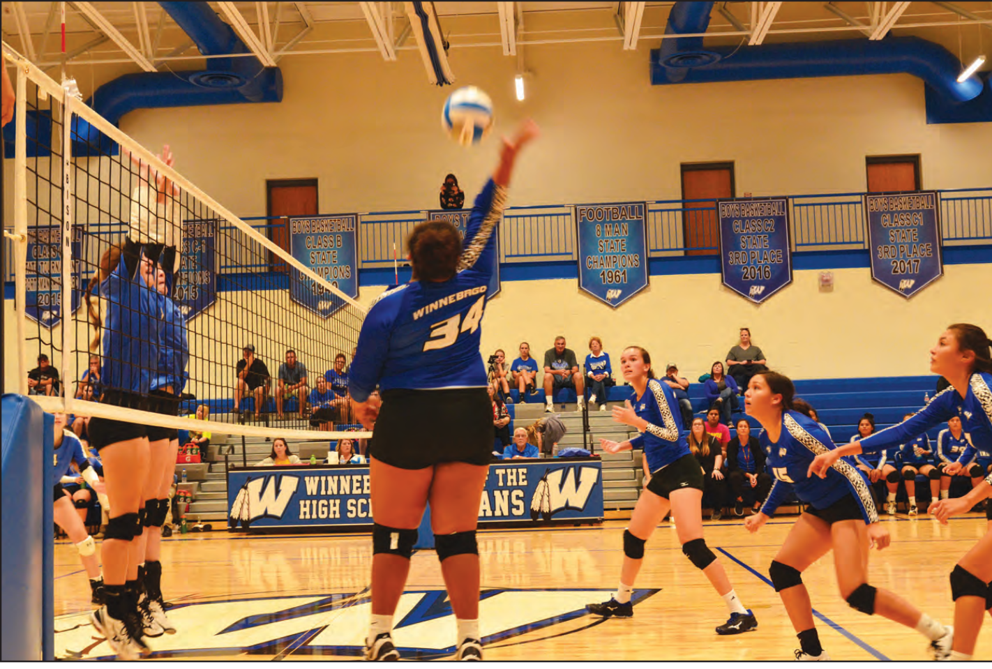
The Winnebago High School Lady Indians Volleyball team is off to a bumping start...I said bumping, not bumpy, with 6 matches under their belts. This year's team consists of 5 Seniors, 6 Juniors and one Sophomore, they even have a couple of new Coaches. A full schedule of their remaining games appears on page 4 of this issue. Go Big Blue!