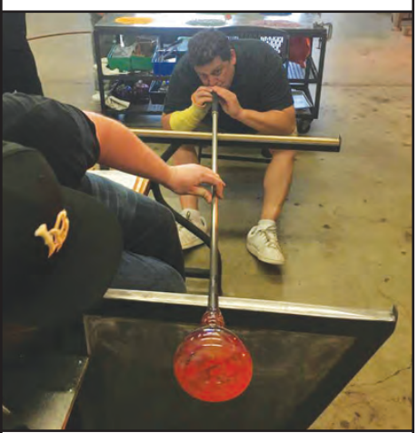
Is that the guy that is naturally full of Hot Air?