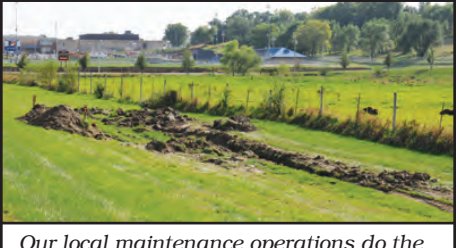
Our local maintenance operations do the best job, no one would disagree. It took the Nebraska Department of Transportation 1 afternoon to ruin the look across the HoChunk Village.