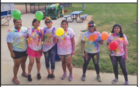
The first Color Walk/Run was a hit last weekend with the Winnebago Community. The event raised awareness for suicide prevention.