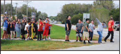
The Whirling Thunder Wellness Center is at it again getting our kids practicing good Healthy life habits. Walking Wellness is on the go, watch out for our kiddies.