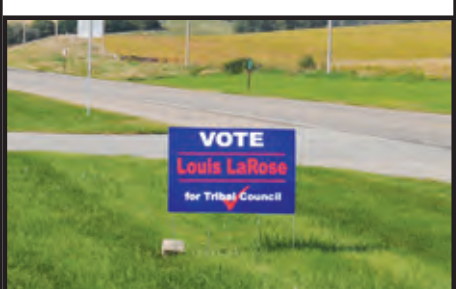
Winnebago Tribal Council Regular Elections are on Tuesday, October 4th, 2018. Don't forget to VOTE.