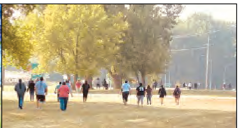
The WIC Staff handed out some awesome looking t-shirts to the walking participants. If you didn't get one you truly missed out.