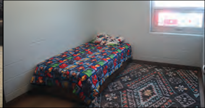
The newly renovated Winnebago YCIC is looking nice.