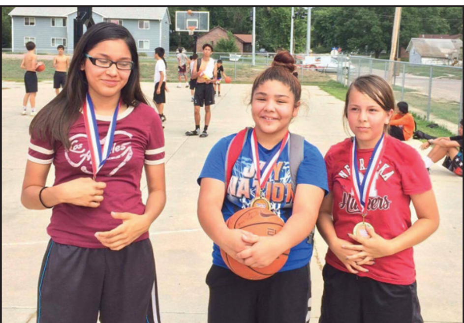
Jr. High Girls Champions: Scrubs