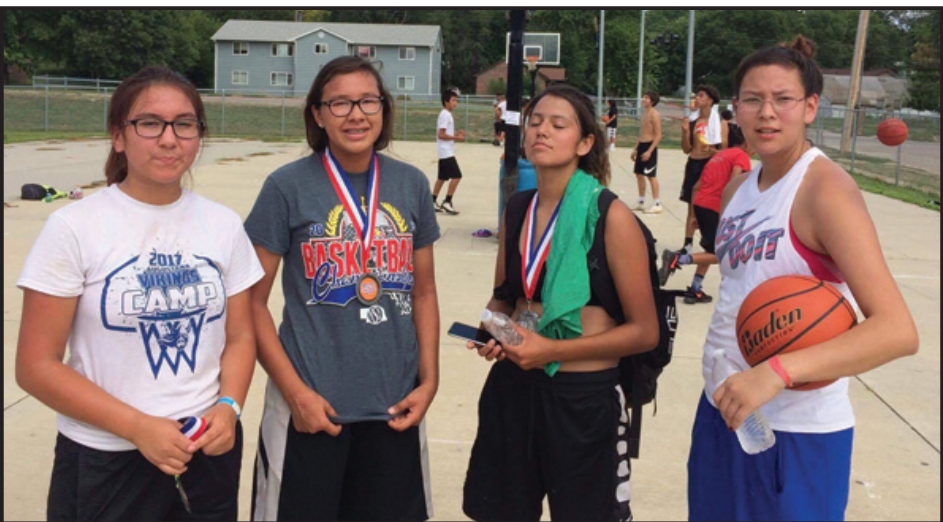
High school Girls Runner Up: BAHK