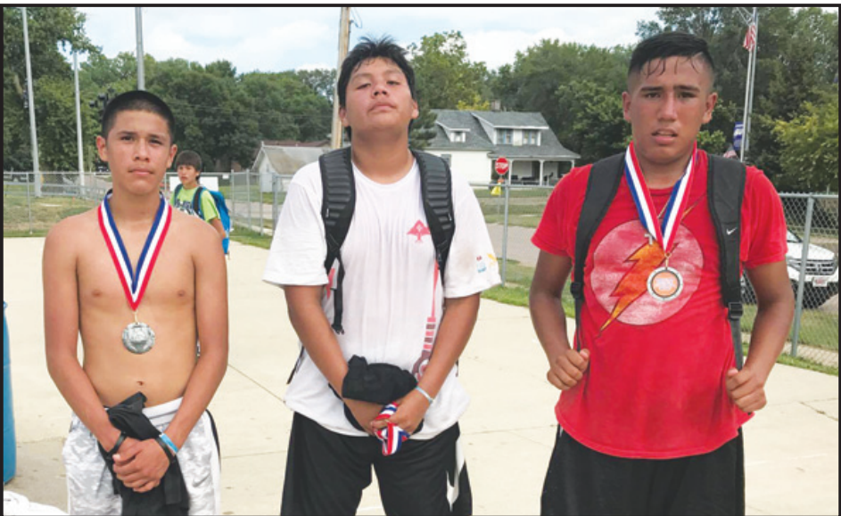
High school Runner Up: Z02