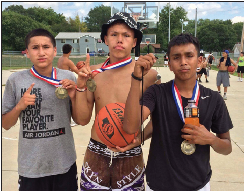
Jr. High Boys Champs: Native Elite