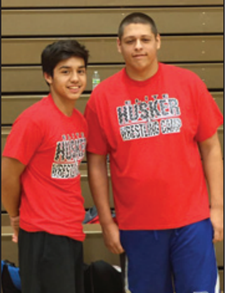
WHS Wrestling team stand-outs attend Huskers Wrestling Camp last week to up their game.