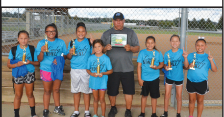
The girls 10 and under team from Winnebago captured the Championship at the Sioux City Softball Leagues.