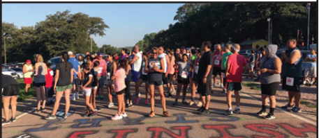
The Wilderness Walk/Run at this years Powwow was a hit with all the running enthusiasts.