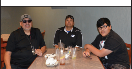
The WIN Staff enjoying some Flowers Island Buffet after a big meeting.