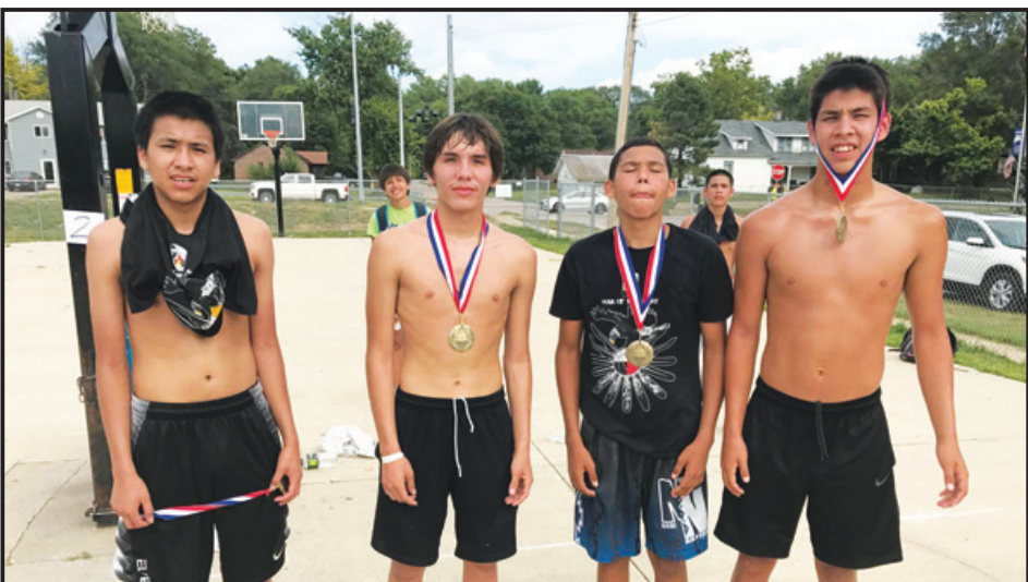
High school Boys Champions: Big Ballers