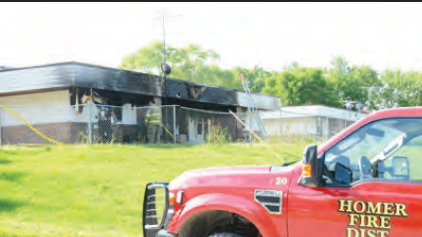
An electrical fire recently occurred at the Winnebago Senior Citizen Complex in Winnebago, Neb. Though the damage is extensive, the senior citizens were evacuated safely, and no one was injured. Efforts move forward to help those displaced by the fire, more information will follow.