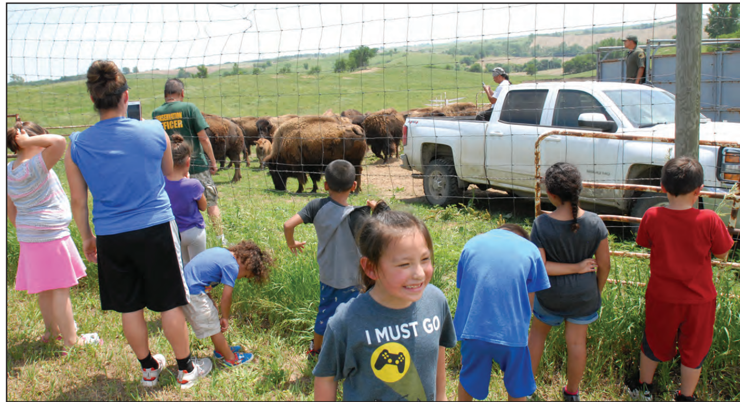
Participants of the Boys & Girls Club summer Program last week loaded up in the vans and headed east to visit the Winnebago Tribe's main Buffalo Herd. The Winnebago Wild Life & Parks Department maintains the main herd and the town herd of 8 head. The Wild Life & Parks personnel baited the buffalo to get close to their visitors and shared general information on the herd and buffalo.