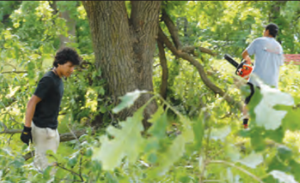
The Summer Youth Employment Program is in full swing on the Winnebago Rez. Some of the teams are already busy on the Powwow Grounds.