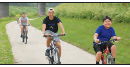
The Whirling Thunder Wellness program is at it again this summer with healthy activities for the youth.