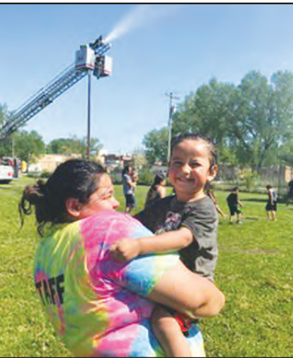
The Winnebago Community Summer kick-off is still being talked about as a fun event. Community hopes are for a monthly event.