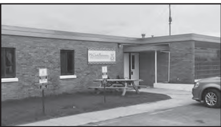
The HoChunk Renaissance program building in Winnebago, Nebraska.