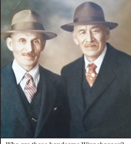
Who are these handsome Winnebagoes? Guess and win a prize from the WIN.