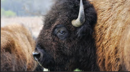
The season changes not only the plant life in Winnebago, but the color of the four legged.