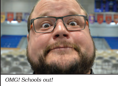
OMG! Schools out!