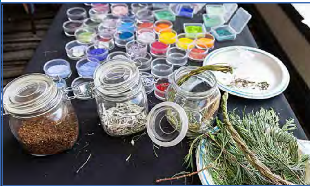
Left: Tobacco, sage, sweetgrass and cedar are 4 of our traditional medicines.