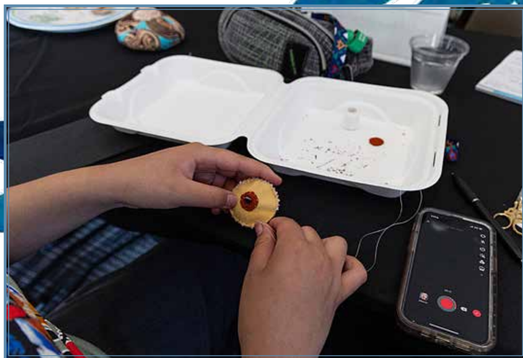
Attendants beaded pins. Inside were stuffed with the 4 traditional medicines.