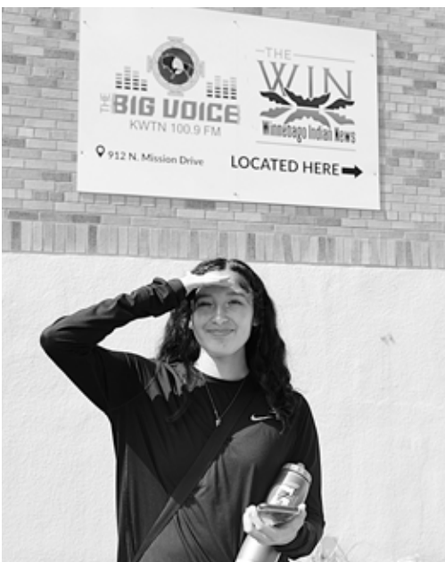
It was just a little sunny this day. She isn't saluting.