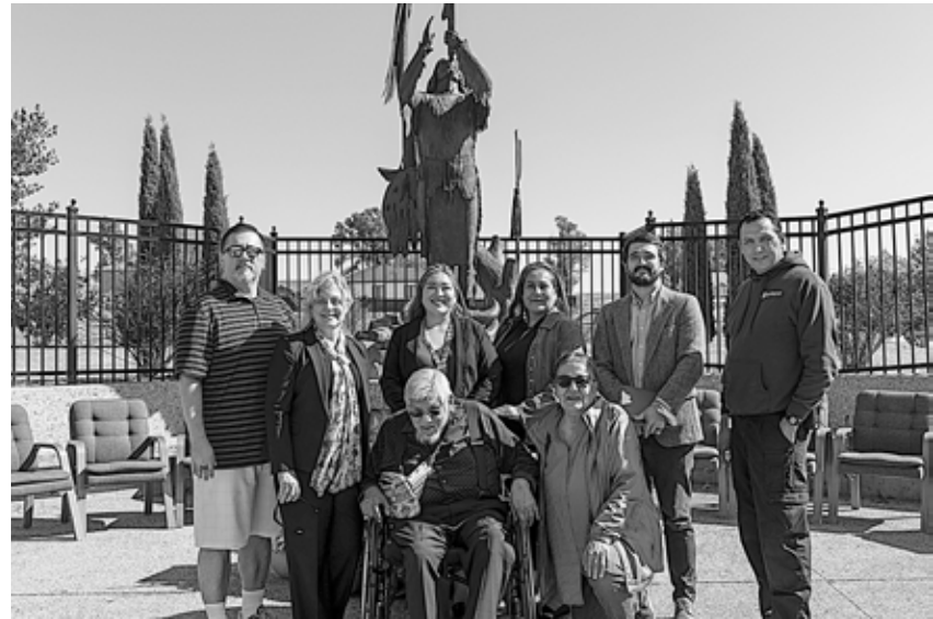
Tribal Council and others announce the "internet for all" grant that the tribe recently received.