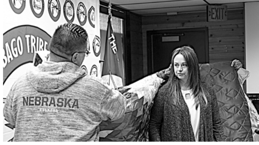
Bottom Right on down: