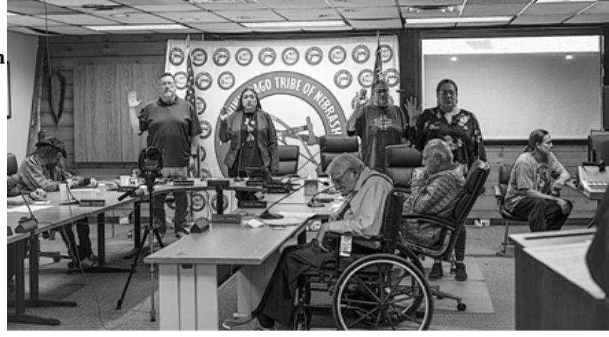
Tribal Council Members were sworn in after the November Tribal Council elections, as well as the elected officers.