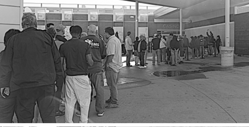
Bottom Left on down:

The line was full with customers ready for the Grand Opening of WarHorse Casino.