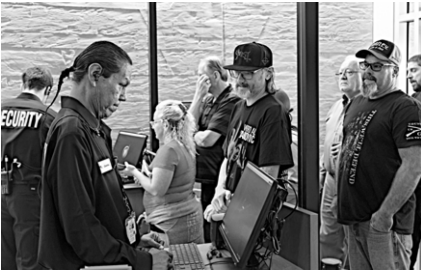
Customers were full of excitement as they entered the temporary building for Warhorse Casino.