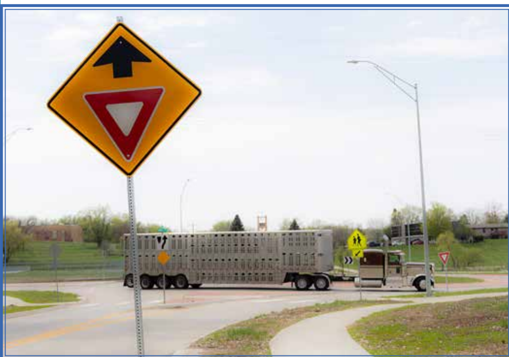
Left: Semi truck with livestock pulls out in the roundabout near St. Augustine's Dr.