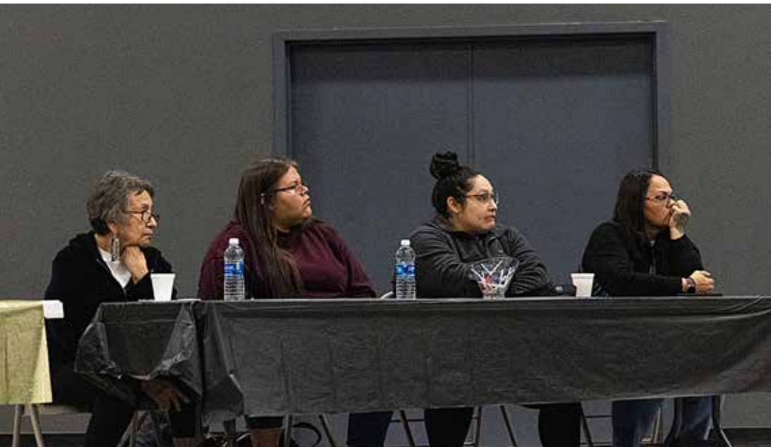
Tribal members listening to the opening remarks.